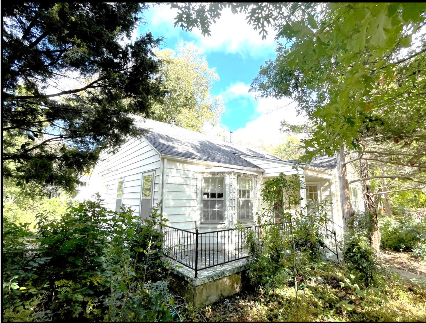
SW Corner of Home Front/Side Yard