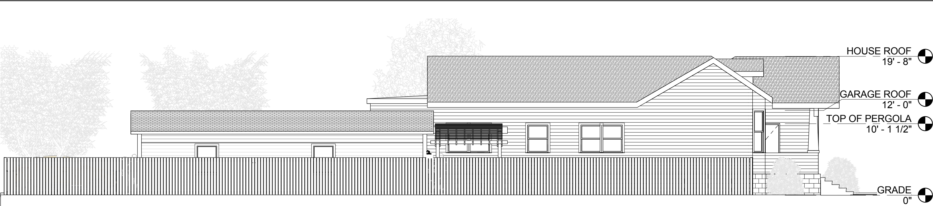
2 SOUTH PROPERTY ELEVATION 1/8" = 1'-0"