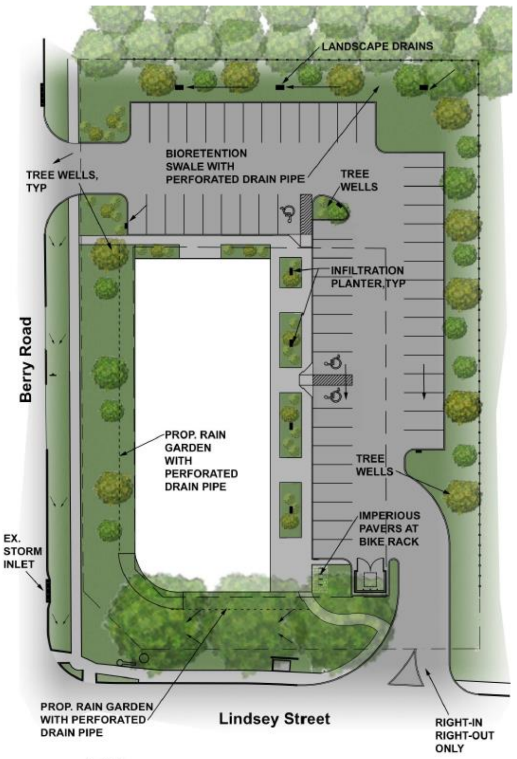
\underline{\textbf{EXHIBIT D}} STORMWATER ENHANCEMENT DIAGRAM