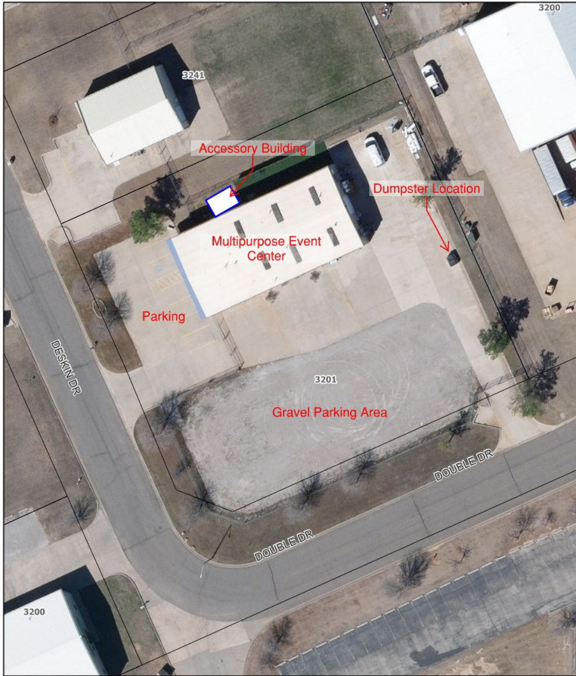
Exhibit B: Site Development Plan