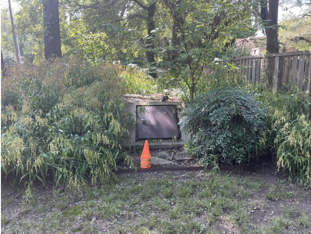
EXISTING STORM SHELTER TO BE REMOVED