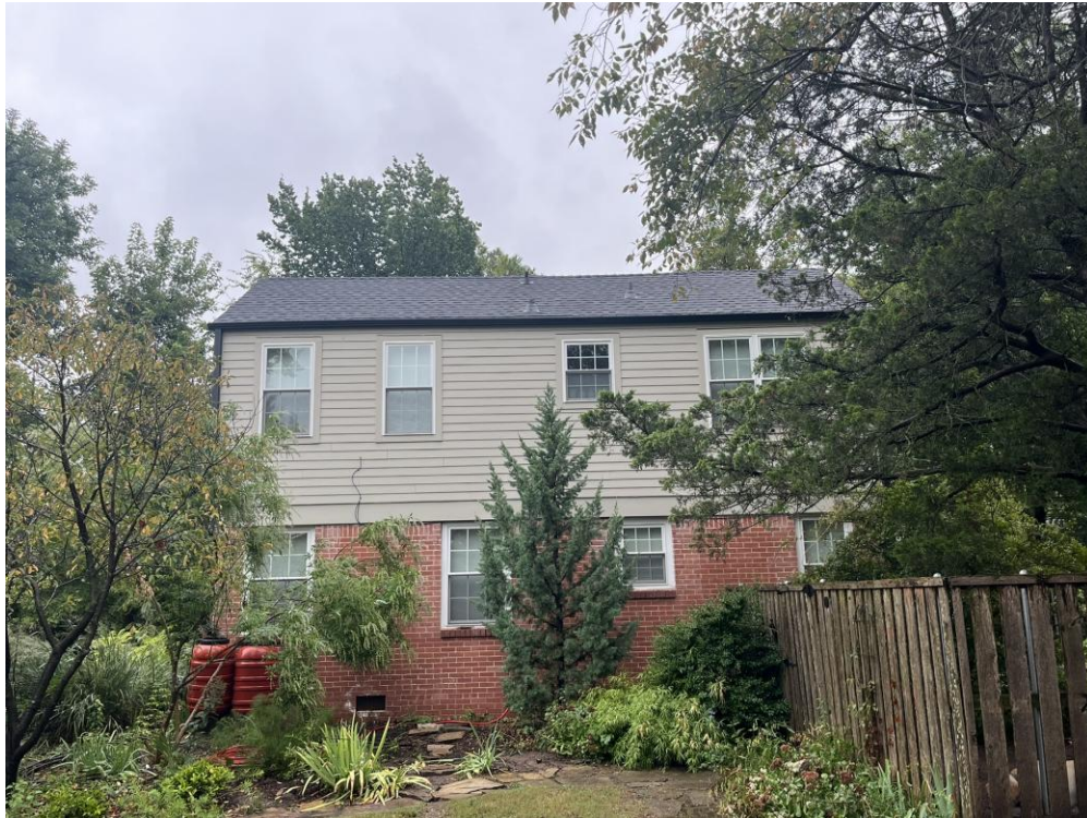
EXISTING HOUSE WEST ELEVATION