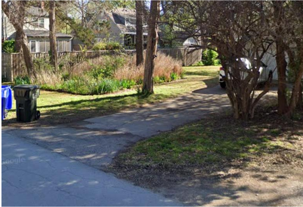
EXISTING DRIVE FROM PONCA AVE