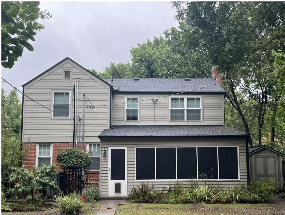
EXISTING HOUSE SOUTH ELEVATION