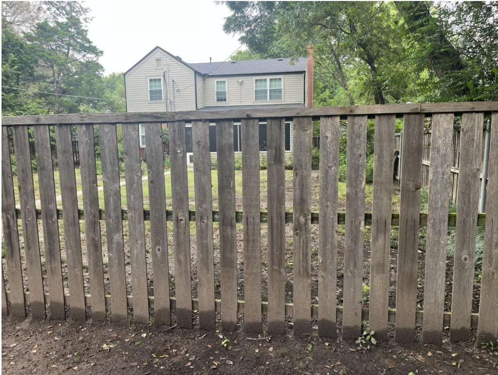
EXISTING FENCE TO MATCH