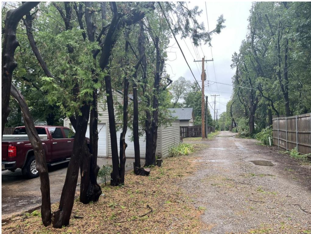
ALLEY LOOKING EAST