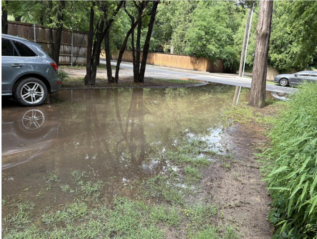
EXISTING DRIVE FLOODING