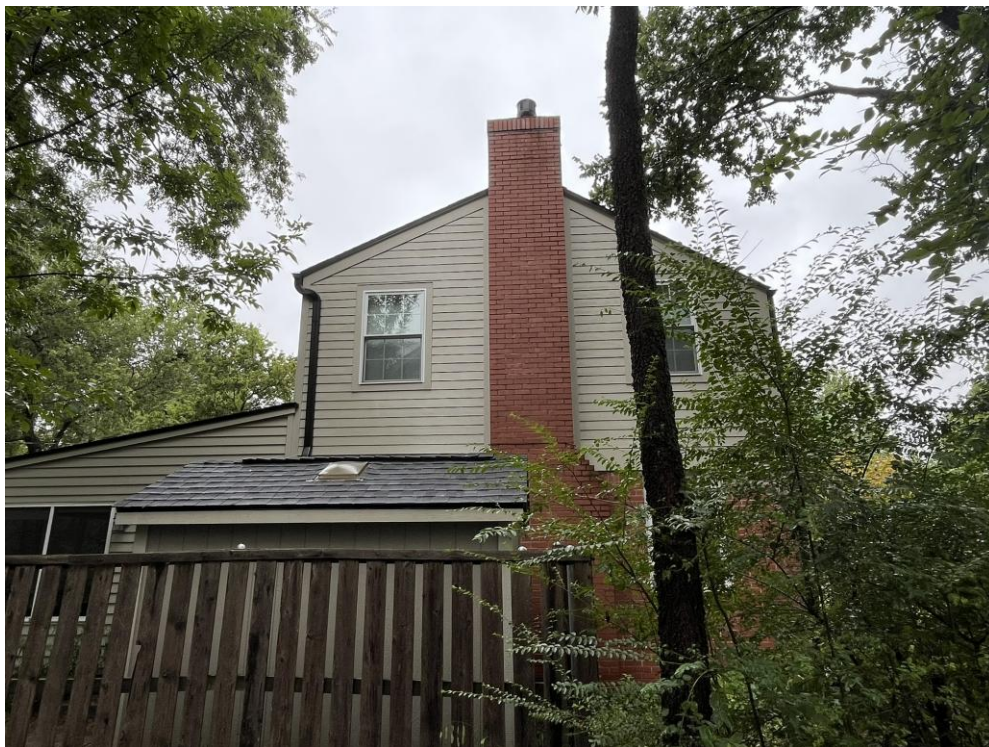
EXISTING HOUSE EAST ELEVATION