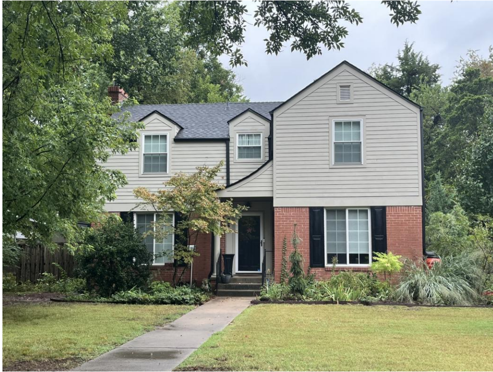
EXISTING HOUSE NORTH ELEVATION