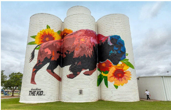
Griffin Park Soccer Complex Mural