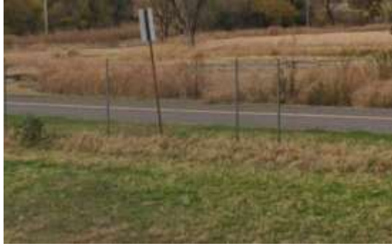
Chain Link Fence