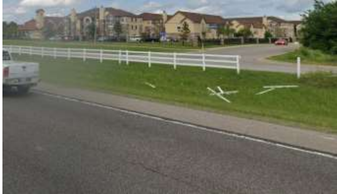
South Moore corridor