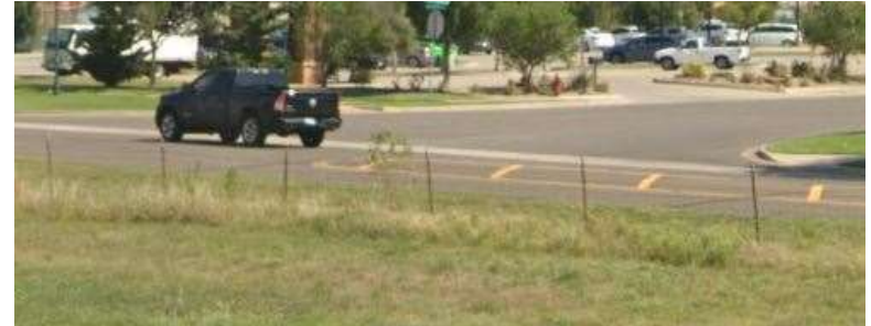
Woven Wire Fence