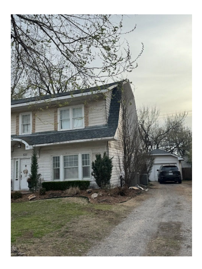
620 Miller Ave. <u>Built 1922</u>