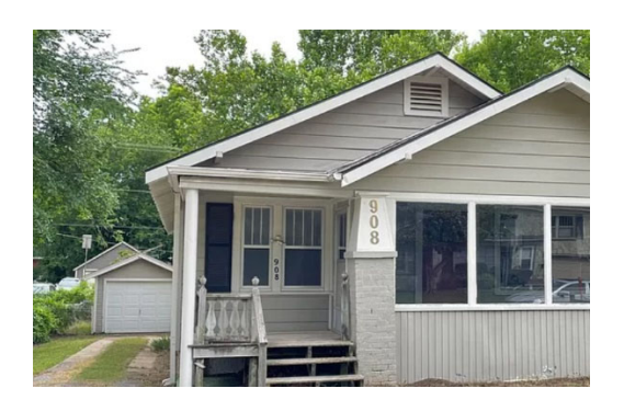
908 Miller Ave. Built in 1923