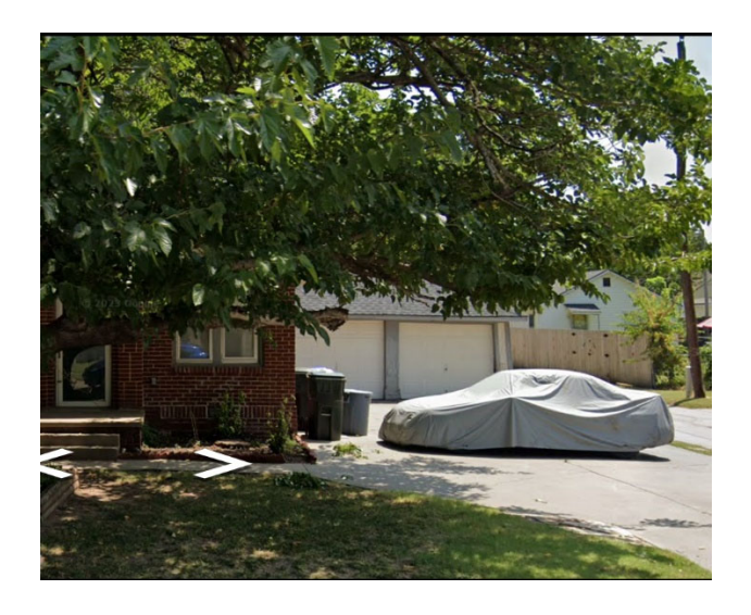
609 S. Crawford Ave. Built in 1930