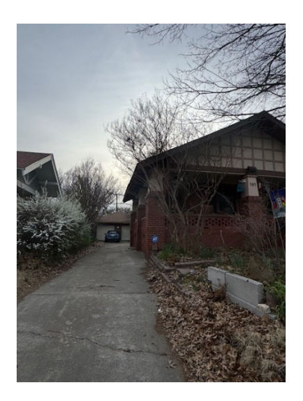
504 Miller Ave. Built 1930