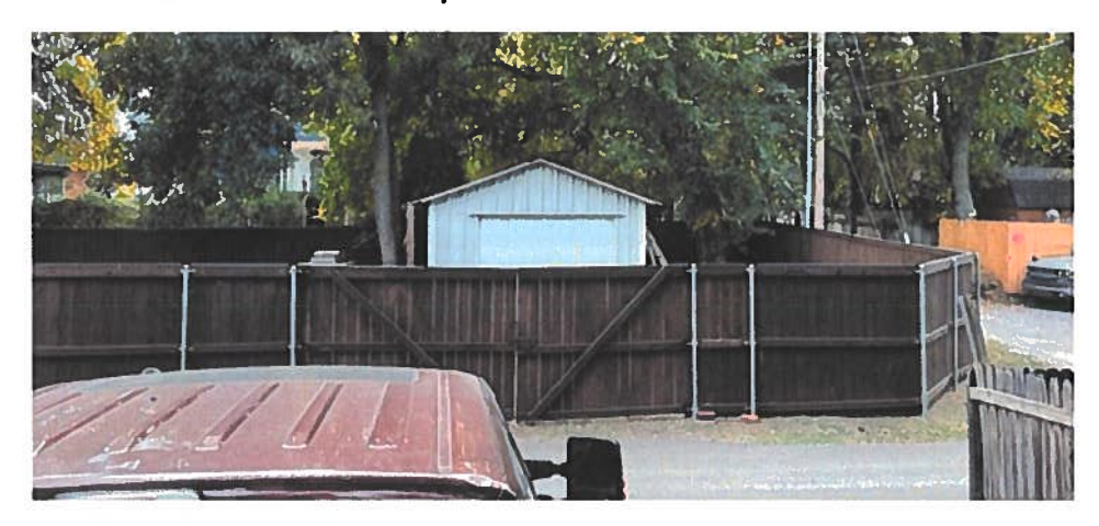
Lots 16 & 15 on the Radius Map