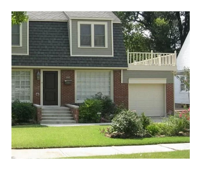
820 Miller Ave. Built in 1940