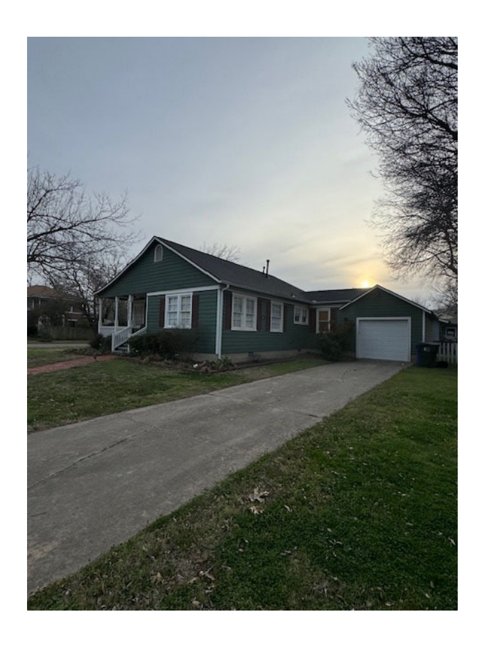
522 S. Crawford Ave. <u>Built 1930</u>