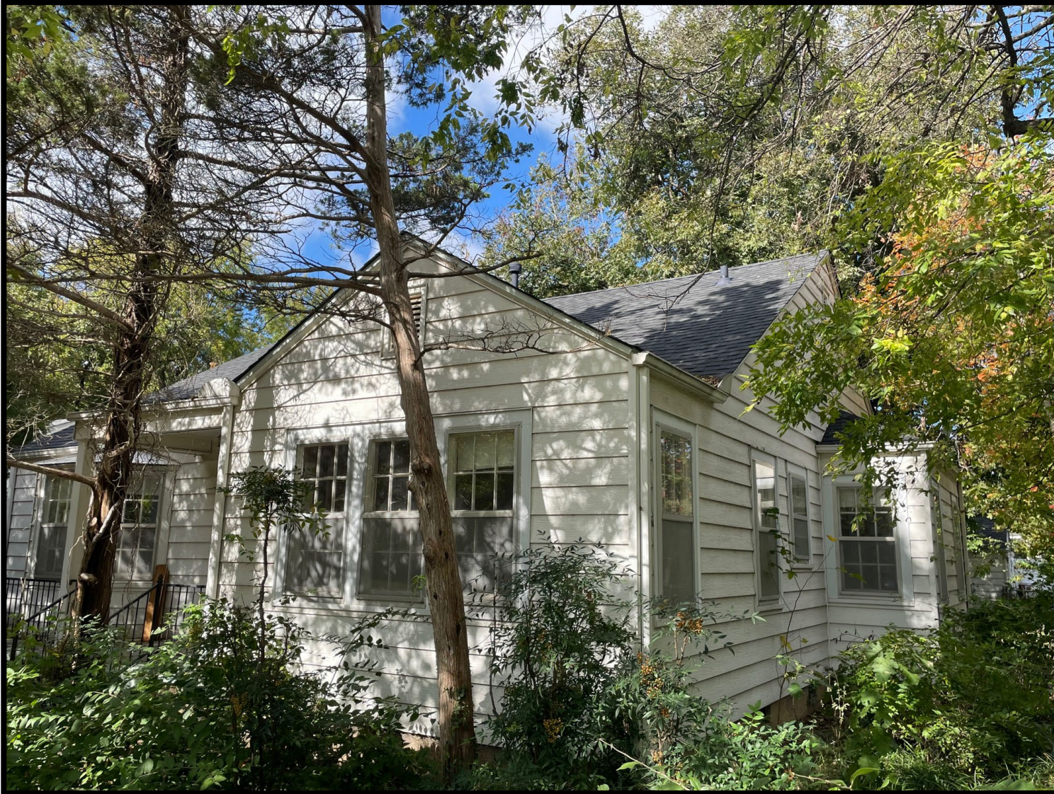
SE Corner of Home Front/Side Yard