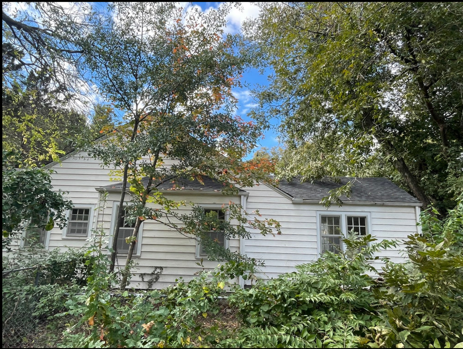
East Side of Home Adj to Oklahoma Ave