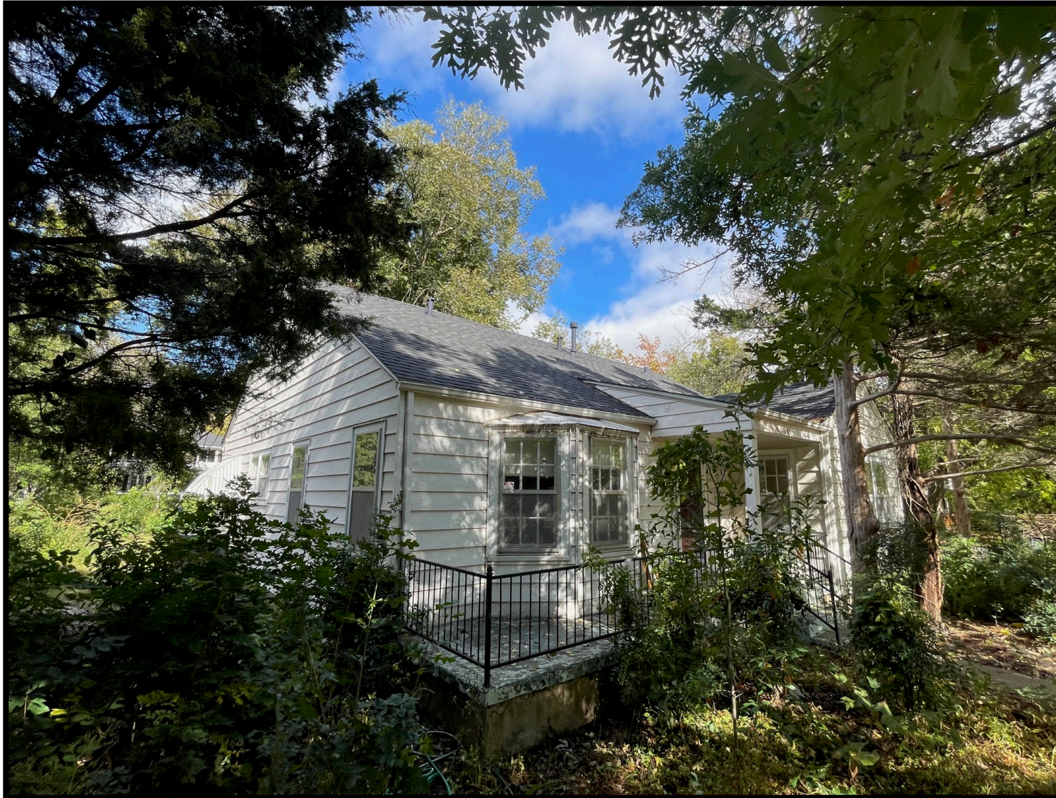
SW Corner of Home Front/Side Yard