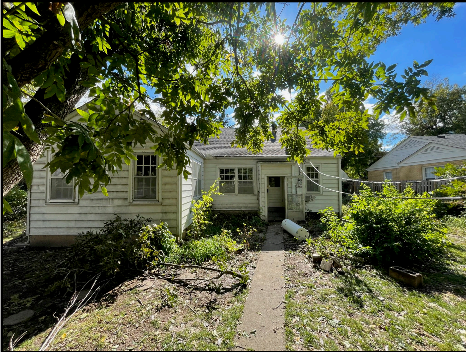
North end of Home Back Yard