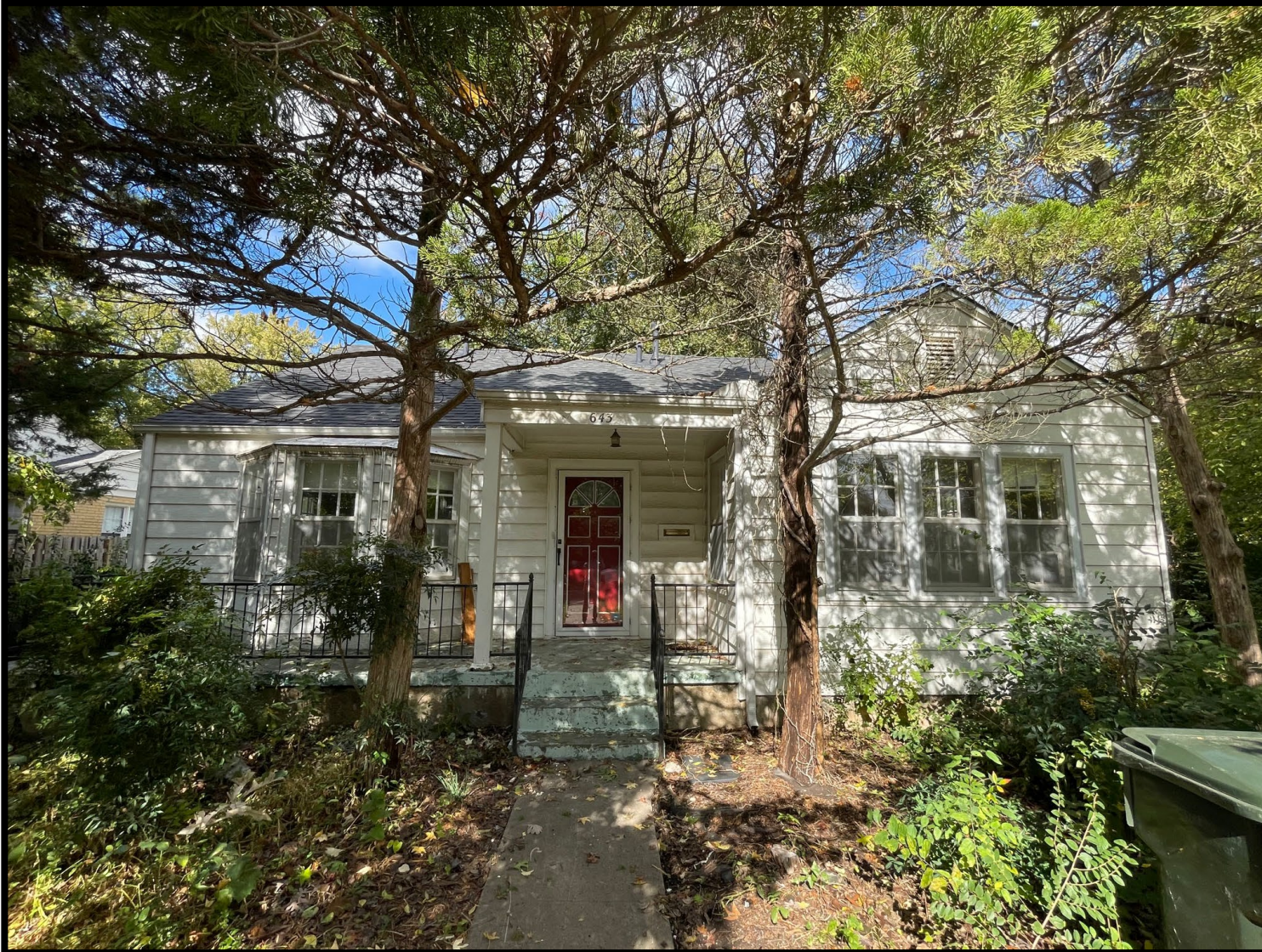
South End of Home Front Yard