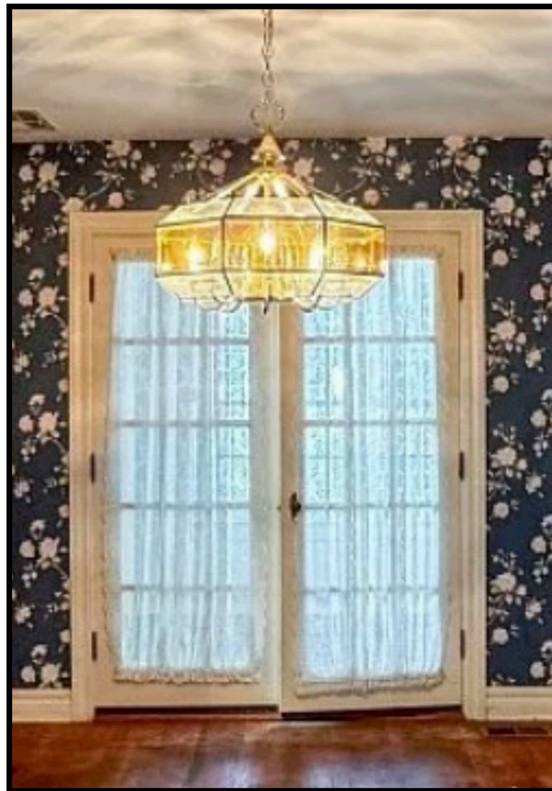
Remove/Reuse interior double doors for new back entry