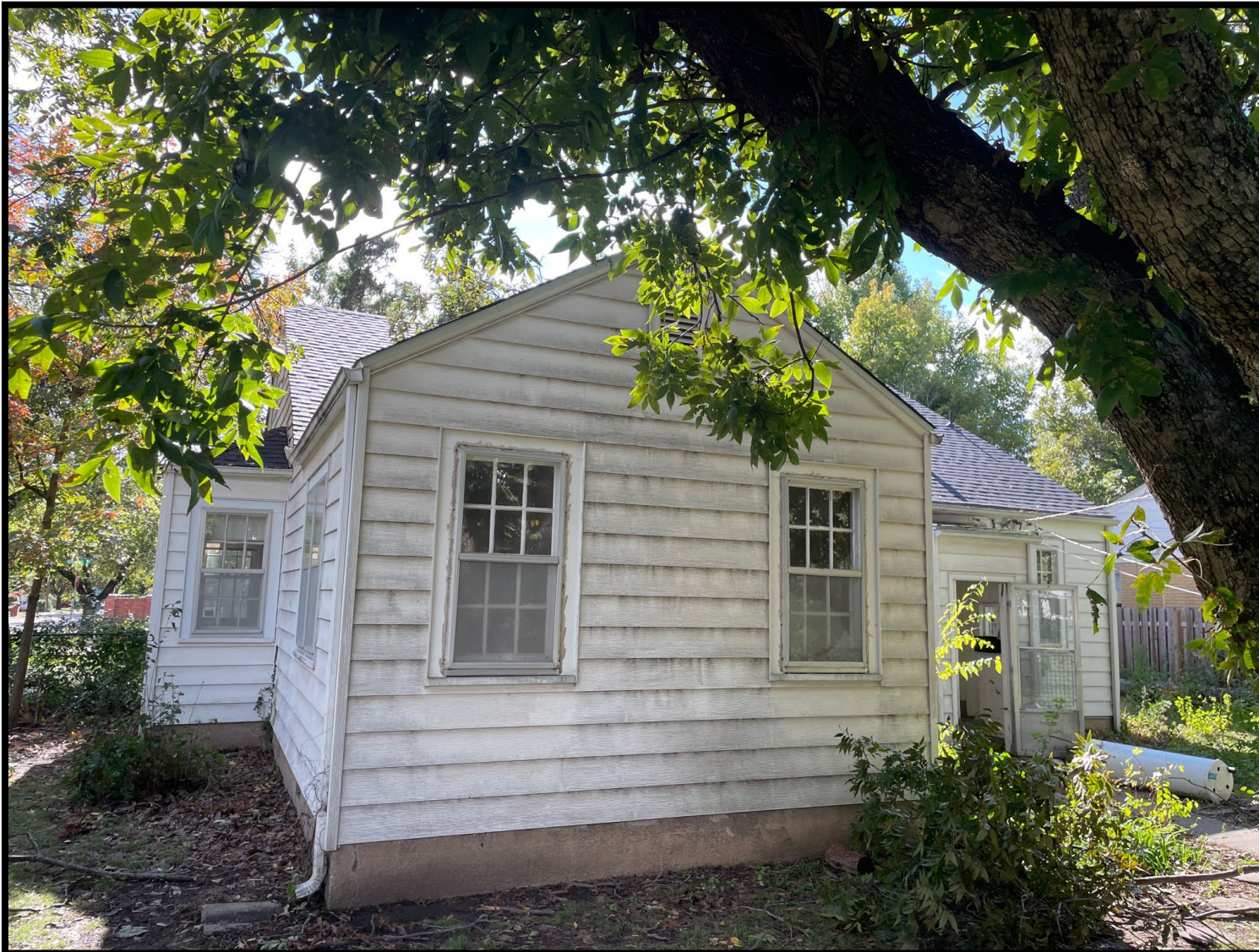
NE Corner of Home Back Yard