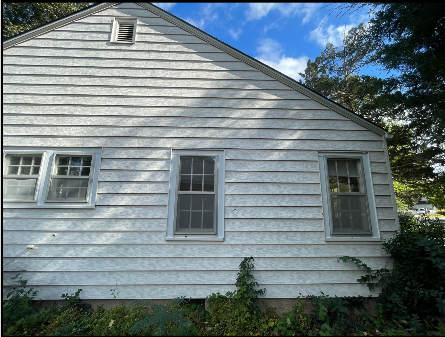
West Side of Home South End