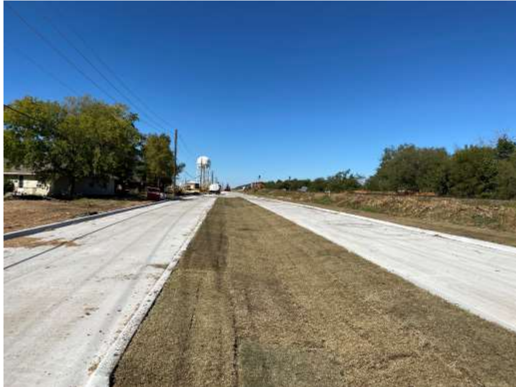
New James Garner Avenue looking north from Himes Street