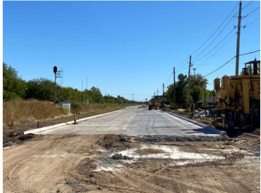
New James Garner Avenue looking south at Hayes Street