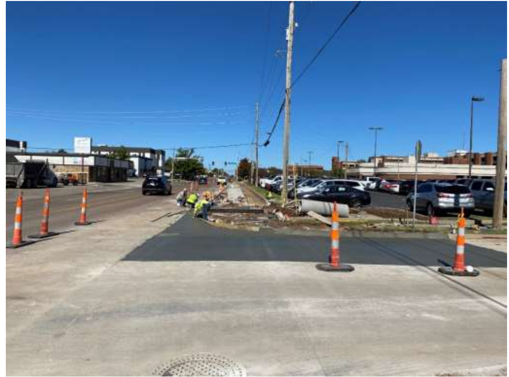
Rich Street looking north on east side