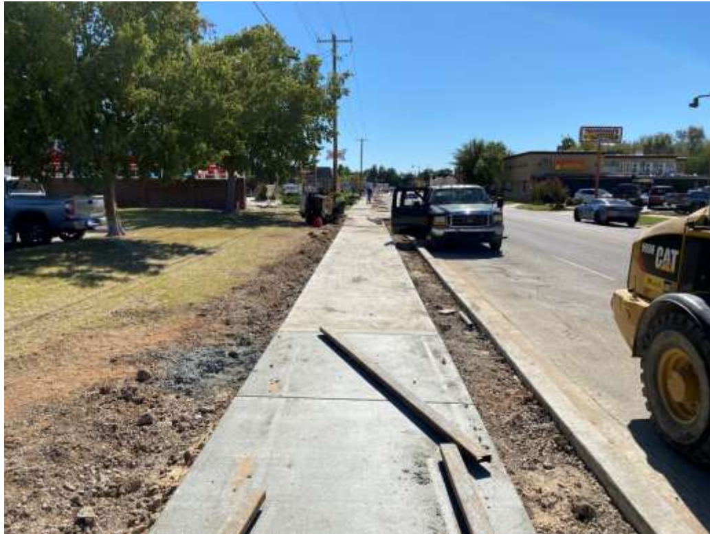
Rich Street looking south on east side