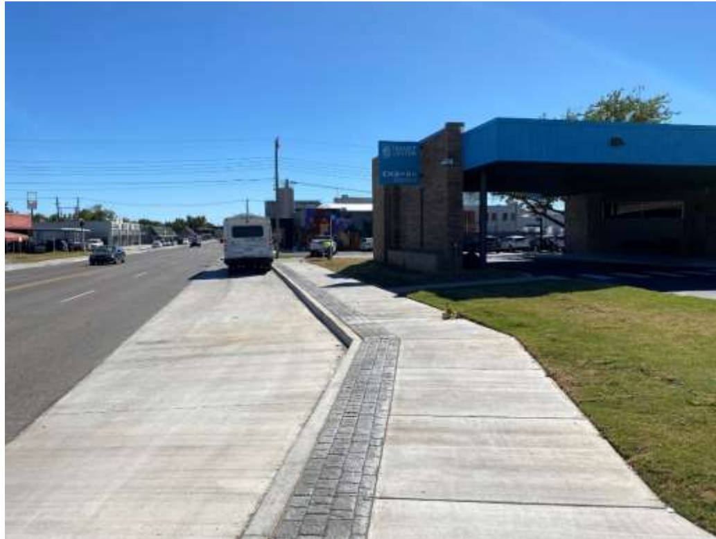
Comanche Street looking south on west side