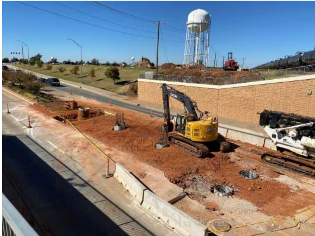
Robinson Street looking northwest at bridge substructure