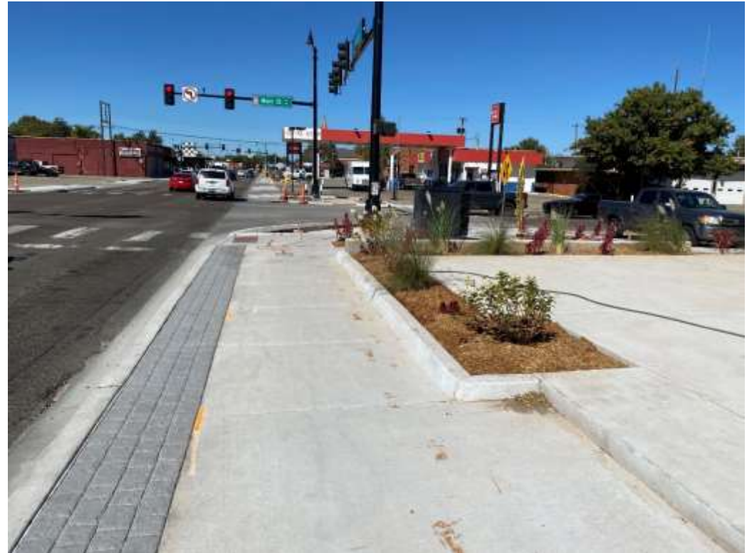
Main Street looking north on east side