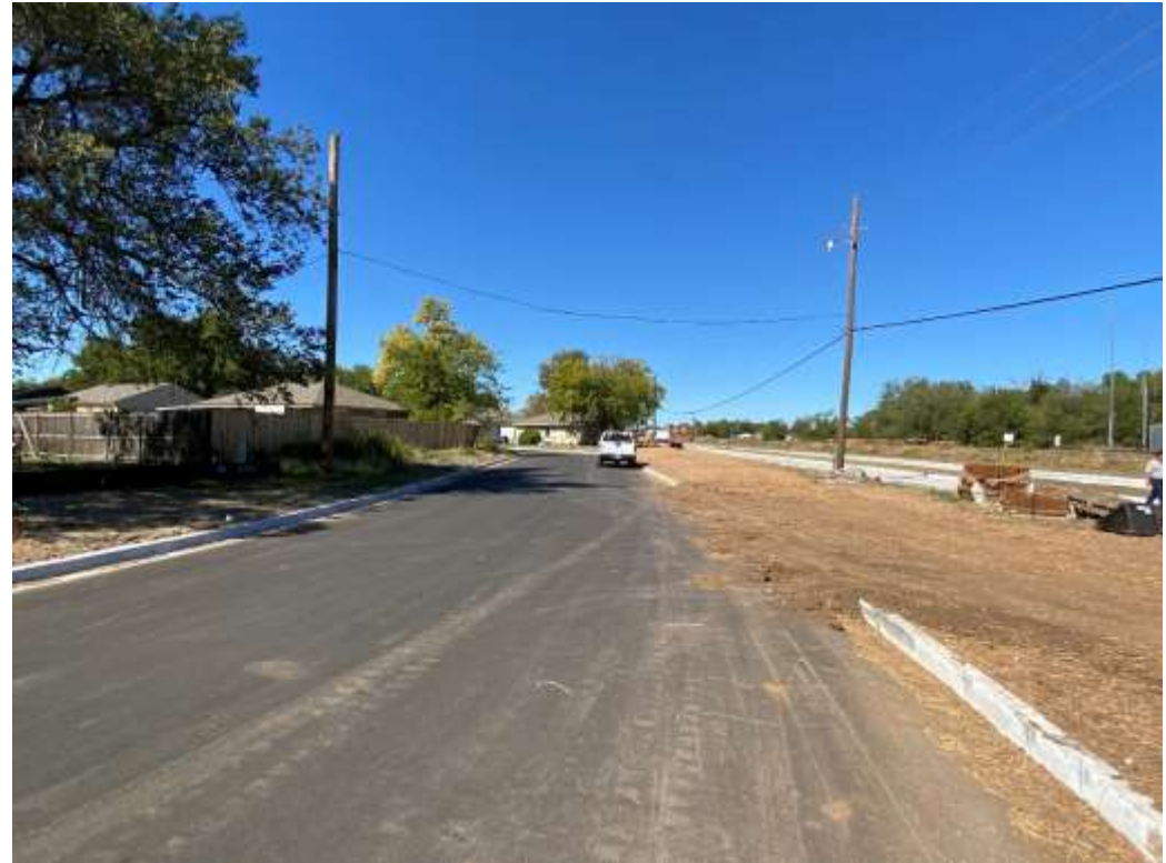
University Boulevard looking north toward Himes Street