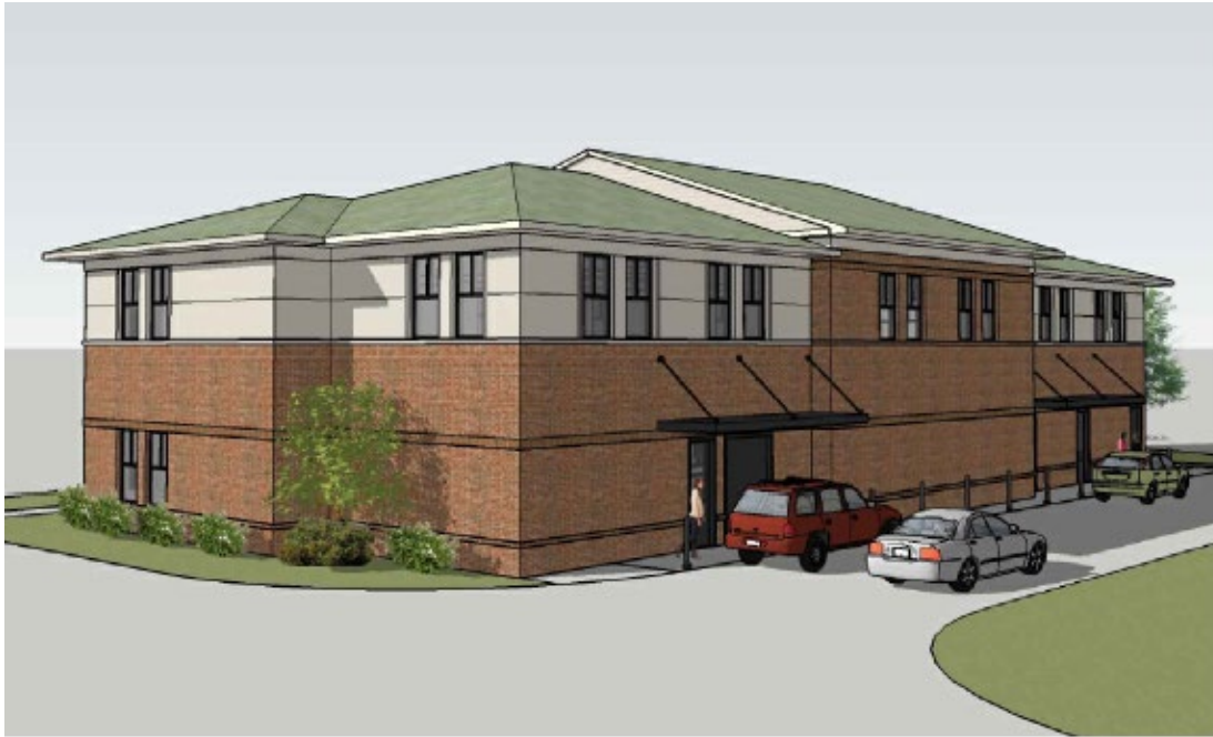
02 MISSION CENTER SOUTHEAST VIEW SCALE: "NO SCALE"