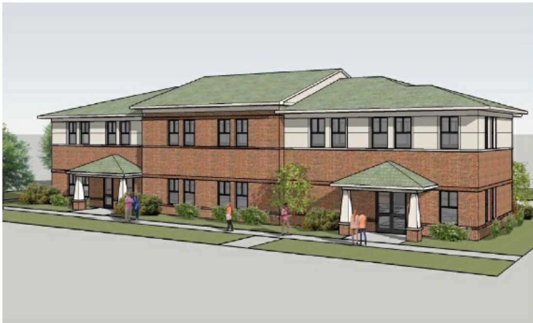
01 MISSION CENTER SOUTHWEST VIEW SCALE: "NO SCALE"