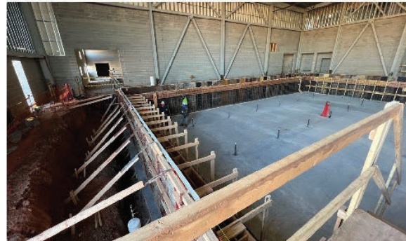
Young Family Athletic Center Natatorium