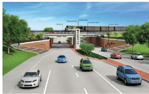
James Garner Avenue Overpass of Robinson Street