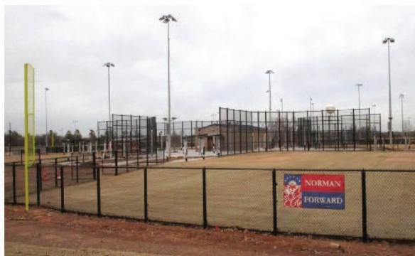
Reaves Park Baseball/Softball Complex