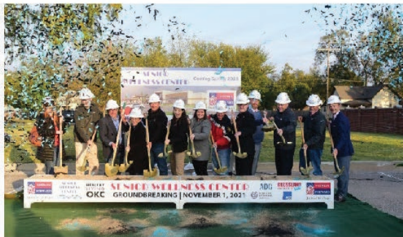
Adult Wellness Center Groundbreaking