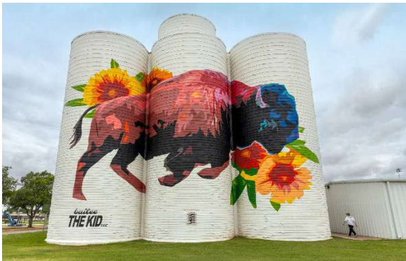
Griffin Park Soccer Complex Mural