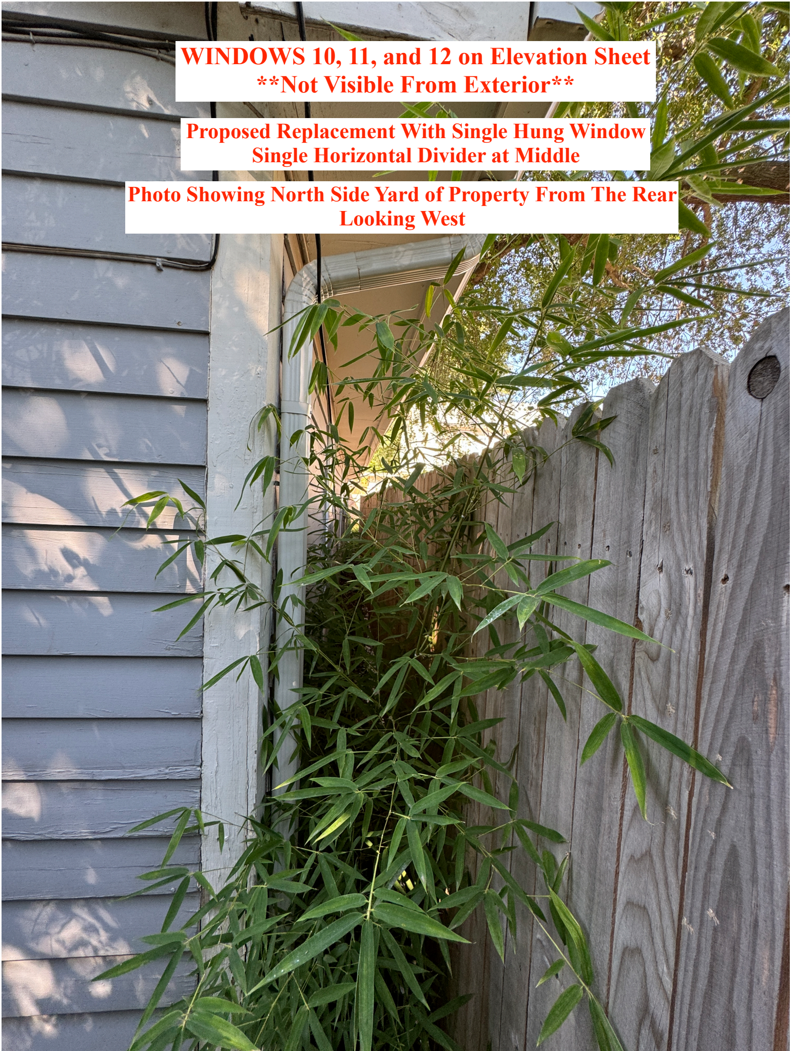
Photo Showing North Side Yard of Property From The Rear Looking West

Proposed Replacement With Single Hung Window Single Horizontal Divider at Middle