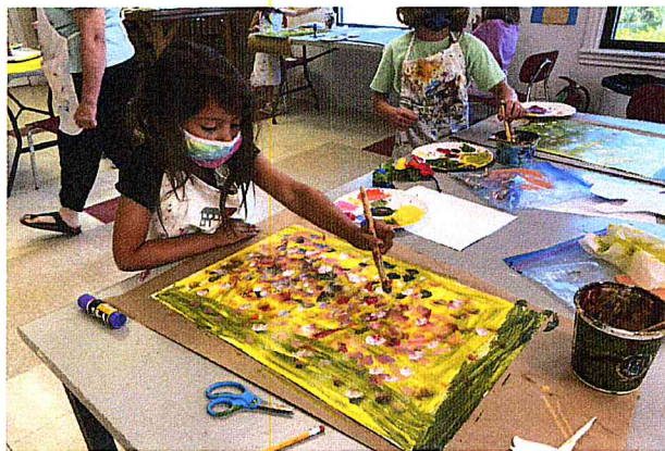
Art After School Program

Art After School classes is offered at $105 per course, which equals a cost of $10.50 per hour for ten hours of high-quality art education.