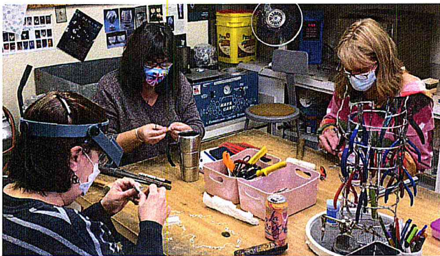
Adult Jewelry Making Class

The Firehouse also provides art learning opportunities to adults with varying degrees of cognitive, physical, and learning disabilities through the Healing Studio program. This visual arts program is intended to nurture and provide an outlet for the creative expressions of these individuals at no cost. The intent of the program is that participants who may feel marginalized or isolated by society will instead feel acceptance and experience an improved quality of life through their art. Every year, the FAC Gallery hosts an exhibition featuring work by Healing Studio participants. This experience has become crucial for the validation of the students, both as artists and as valued members of society. This is the program's most significant source of community support, providing encouragement and recognition to the artists while experiencing art as a fundamental expression of health and diversity. The Healing Studio did not meet FY 2020-2021 but did restart in January of 2022. We have shared our new online curriculum with our Healing Studio students to continue creating art at home.