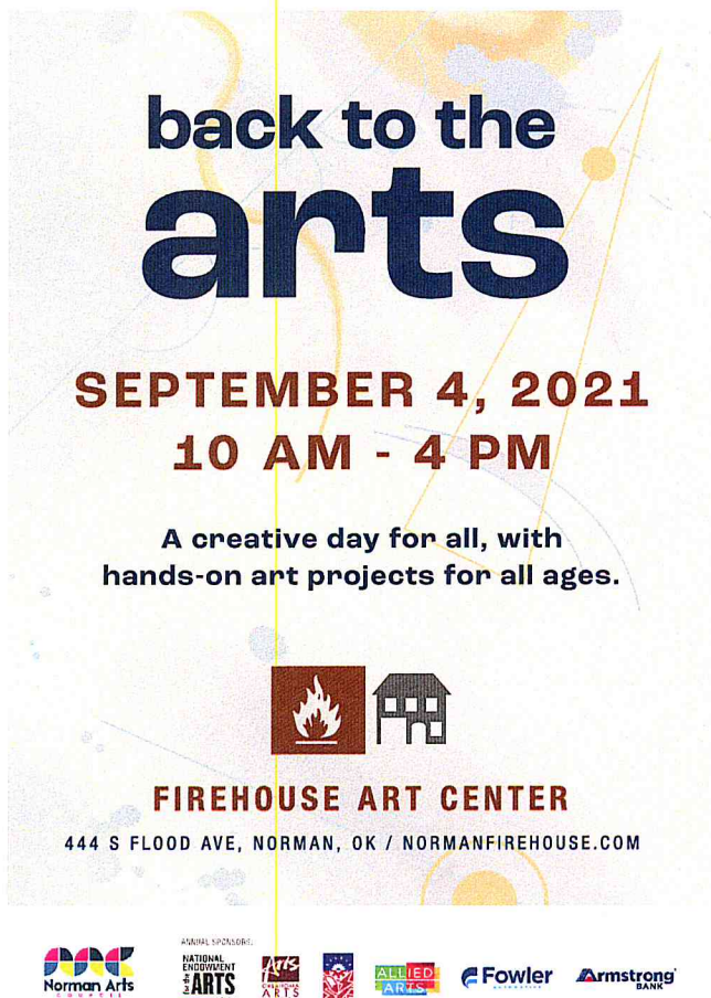
Back to the Arts Poster with Supporters