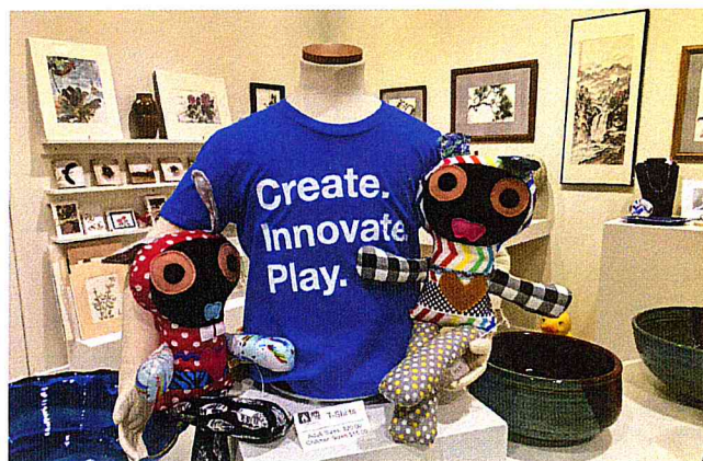
Holiday Gift Gallery 2021