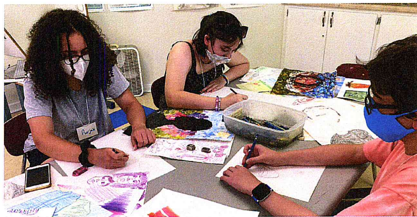
Children's Summer - Youth & Teen, 11 to 16 years old