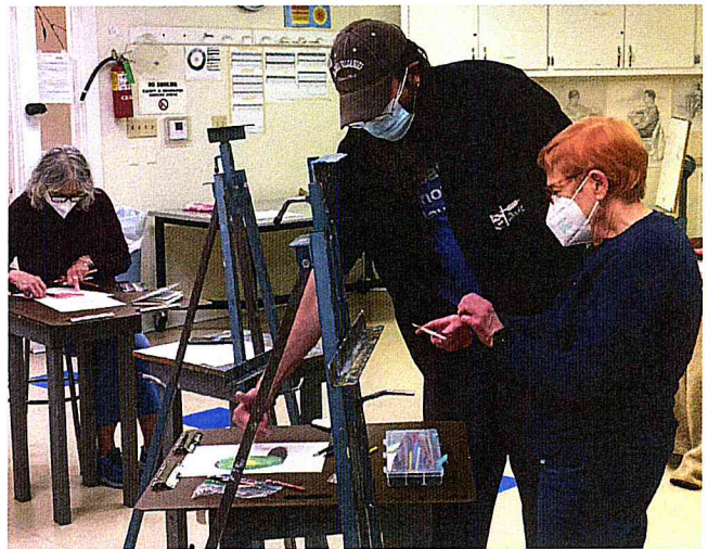
Adult Drawing Class