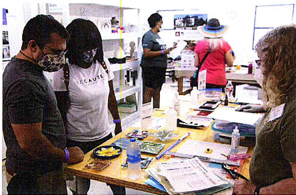
Back to the Arts - Fused Glass Studio

As we come out of COVID restrictions, the Firehouse designed and implemented two events held at our site this year. These were the Veteran's Family Day and the Back to the Arts Day. These events were designed to encourage underserved populations unfamiliar with the Firehouse and its programs and mission. We hope to make Back to the Arts Day a reoccurring yearly event. By developing and refining flexible educational visual arts projects that can serve various partnering organizations' needs, the Firehouse will sustain and grow its community outreach activities in the coming year, enhancing current partnerships and seeking opportunities with other like-minded organizations in the area.