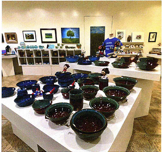
Holiday Gift Gallery 2021