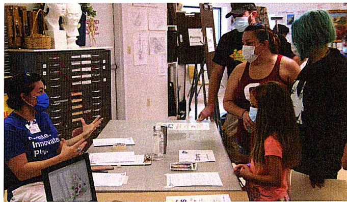
Back to the Arts - Drawing and Painting Studio