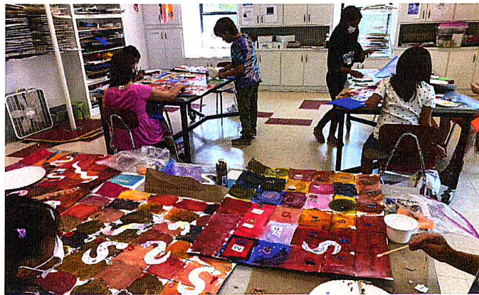
Children's Summer Art Program