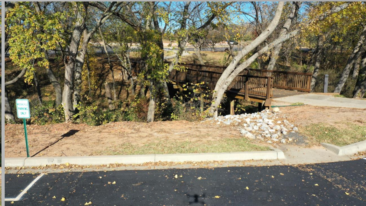
Existing North Pedestrian Bridge