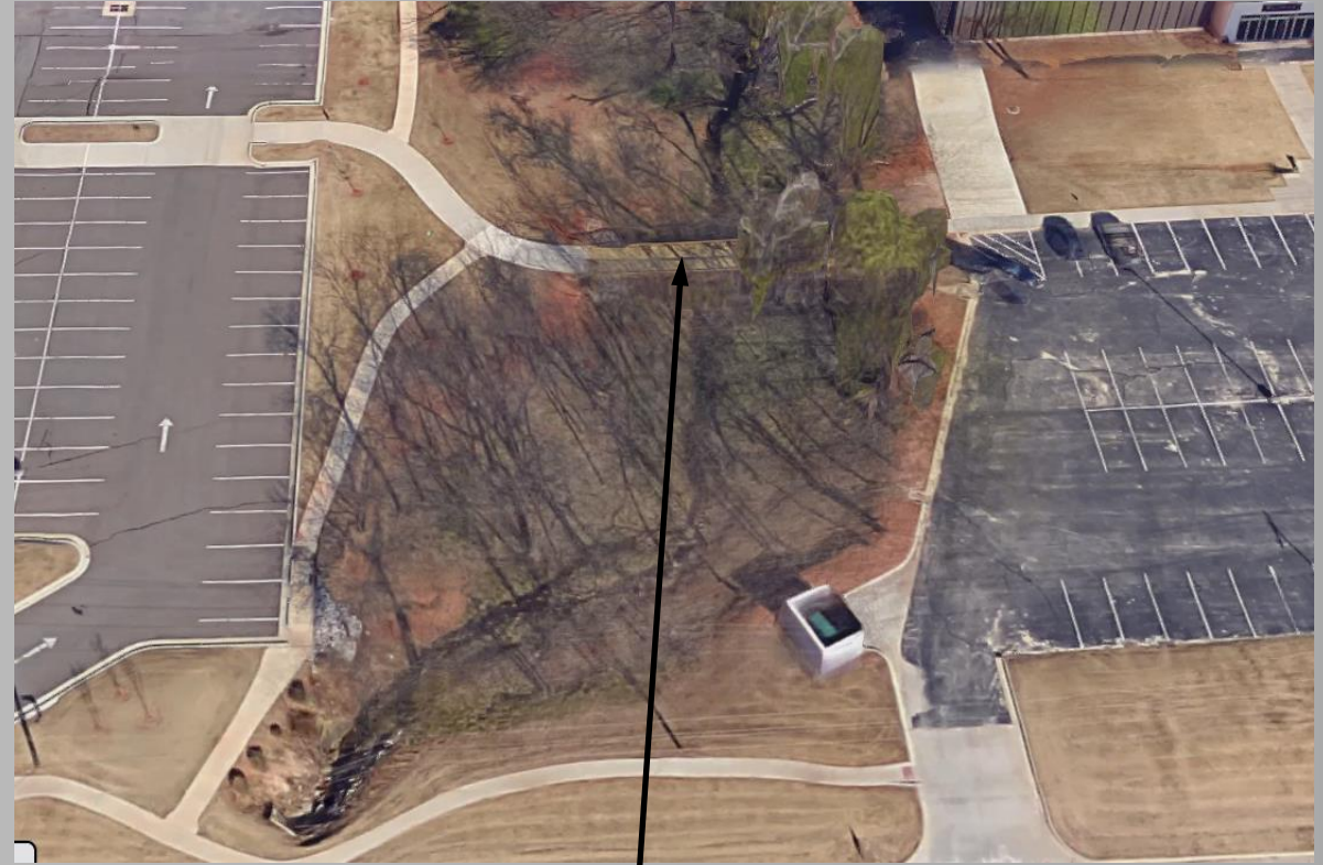
EXISTING NORTH PEDESTRIAN BRIDGE