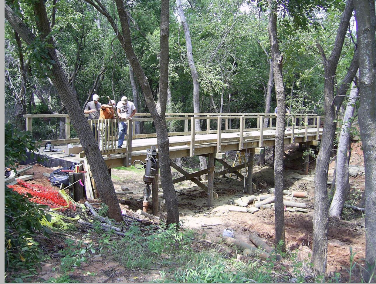
North Pedestrian Bridge Installation in 2007