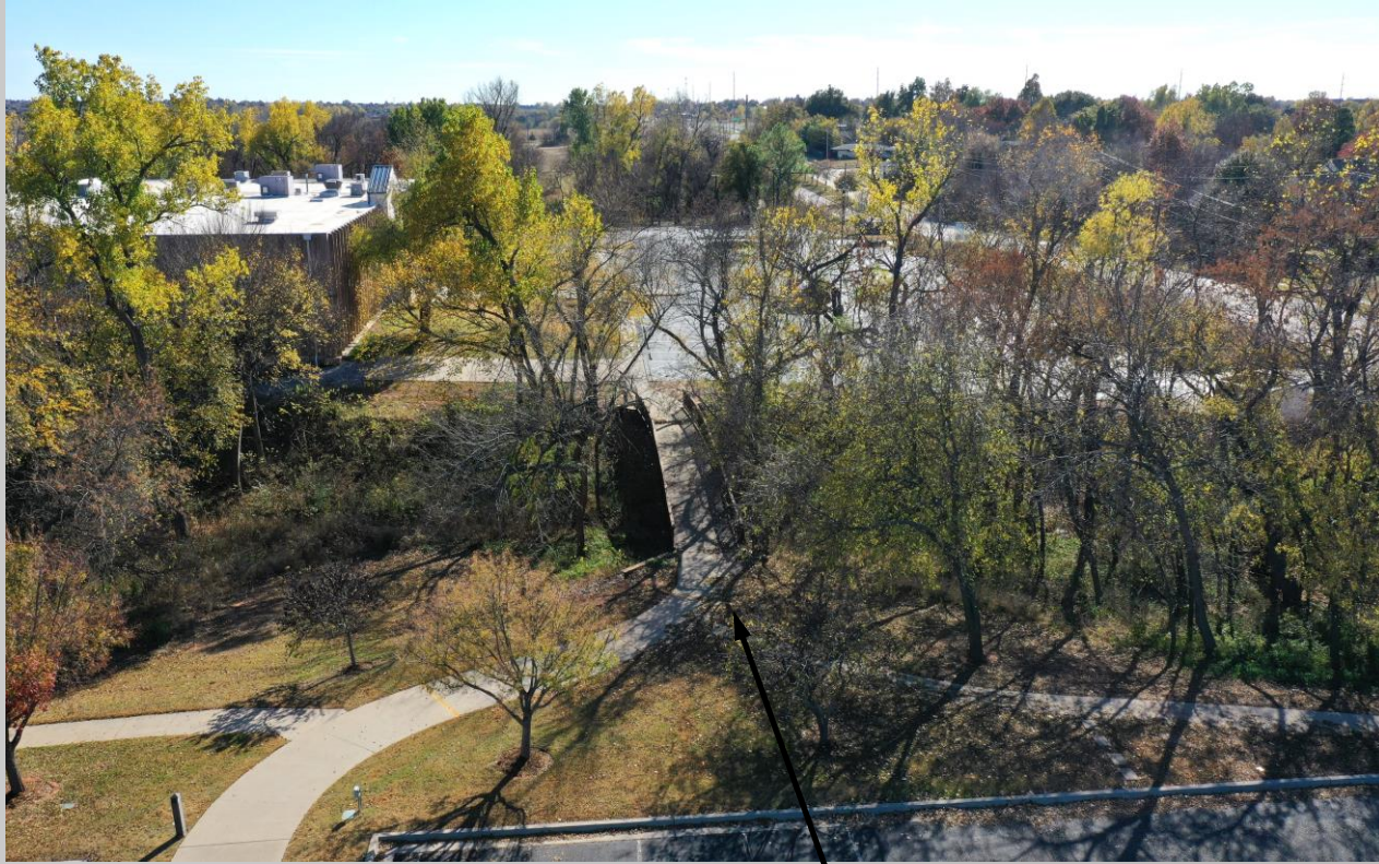
EXISTING NORTH PEDESTRIAN BRIDGE