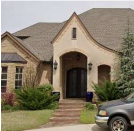
CITY OF NORMAN