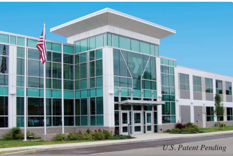
U.S. Patent Pending