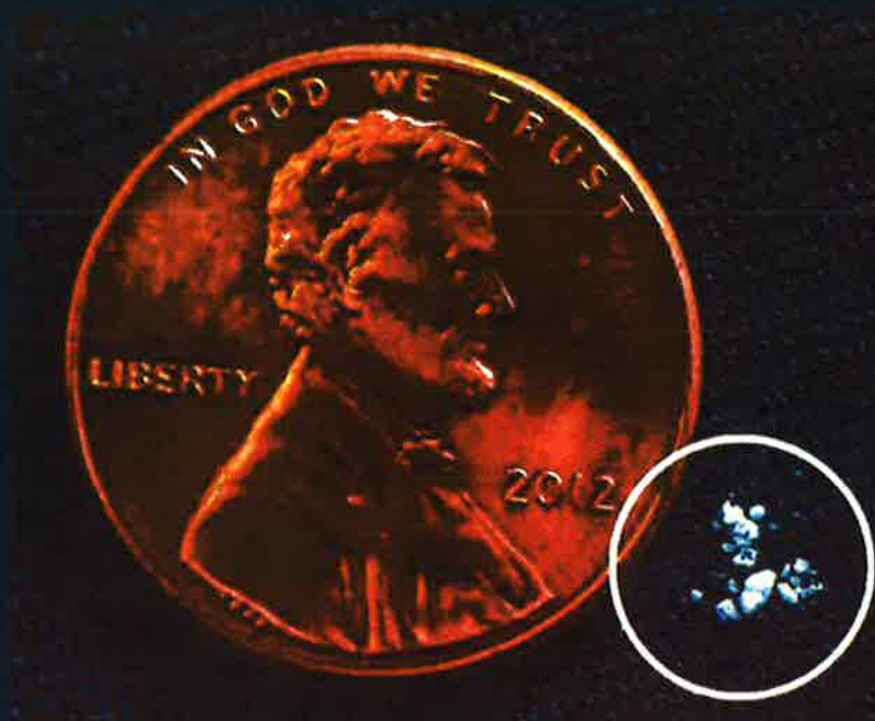
U.S. penny compared to a potentially lethal dose of fentanyl.