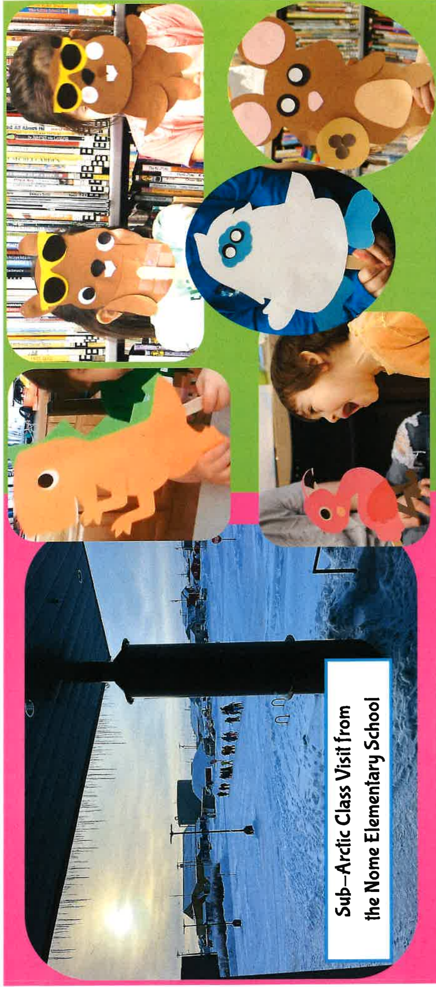
Sub—Arctic Class Visit from the Nome Elementary School