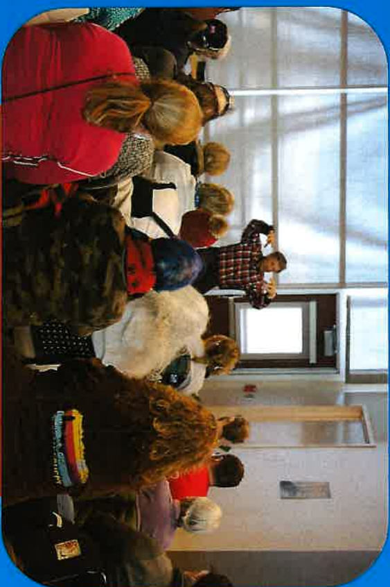
Martin Buser: Meet & Greet