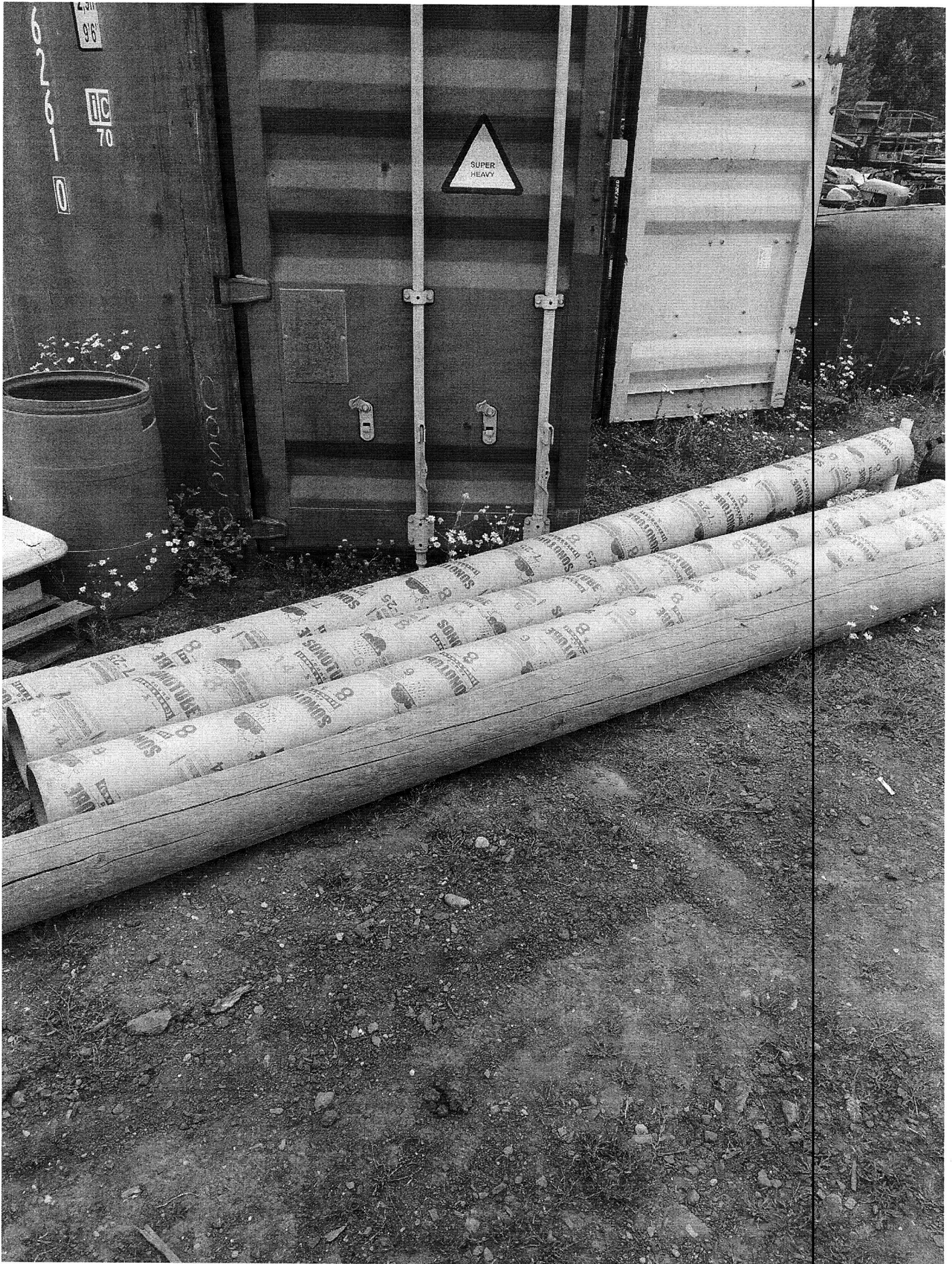
Condition # 6 Sonotubes for office pilings