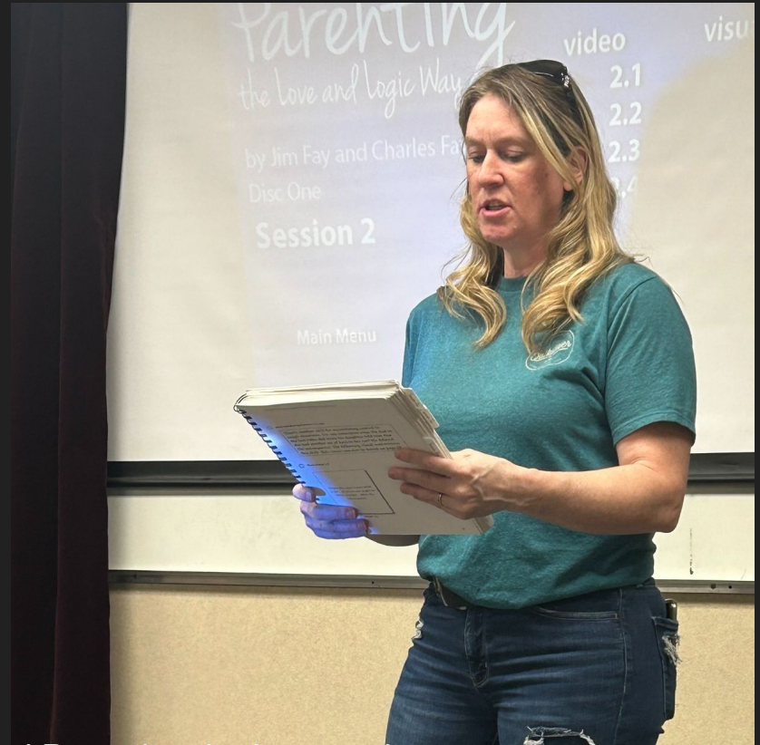
Active Parenting of Teens and Parenting the Love and Logic Way