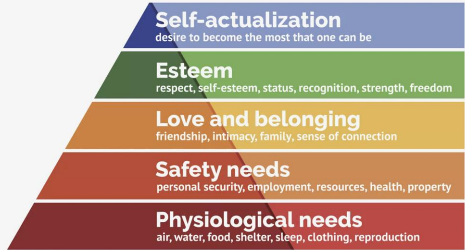
Maslow's hierarchy of needs

-Maslow's hierarchy of needs illustrates the need for basic needs before higher levels of thriving can occur.