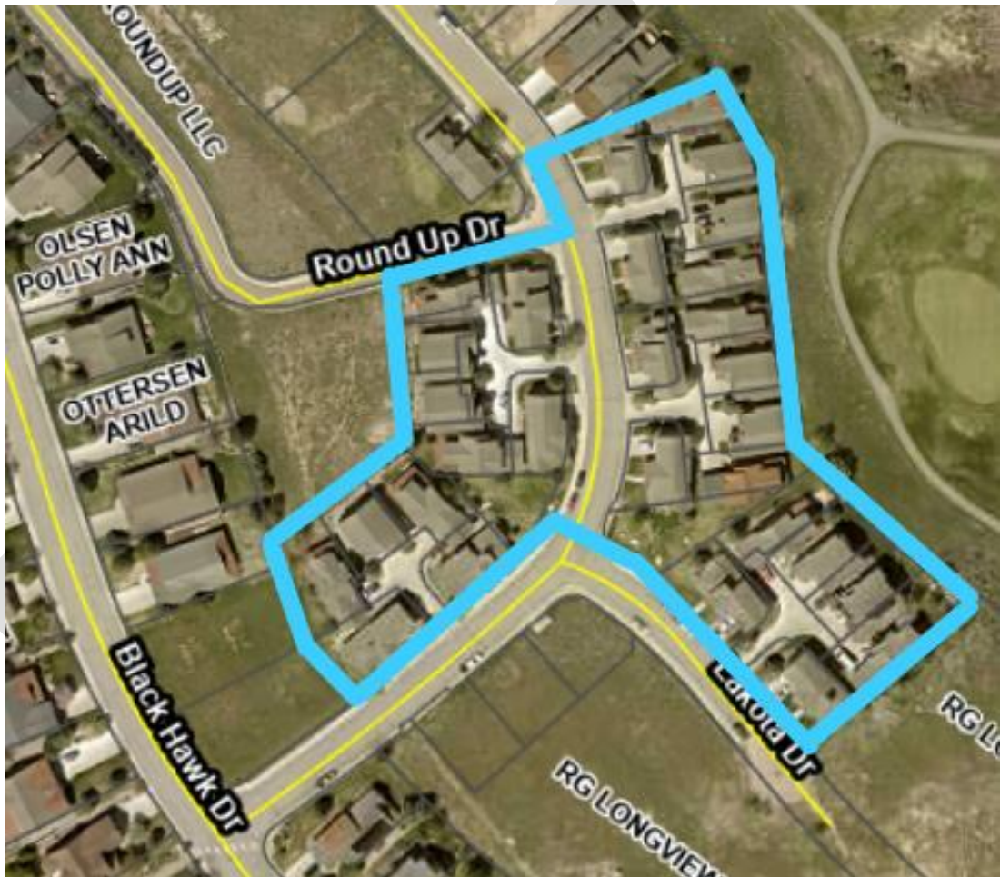
9 10 11 12 13 14 15 16 17 18 19 20 21 22 23 24 25 26 27 Figure 1 - White Horse Village, Phase 1