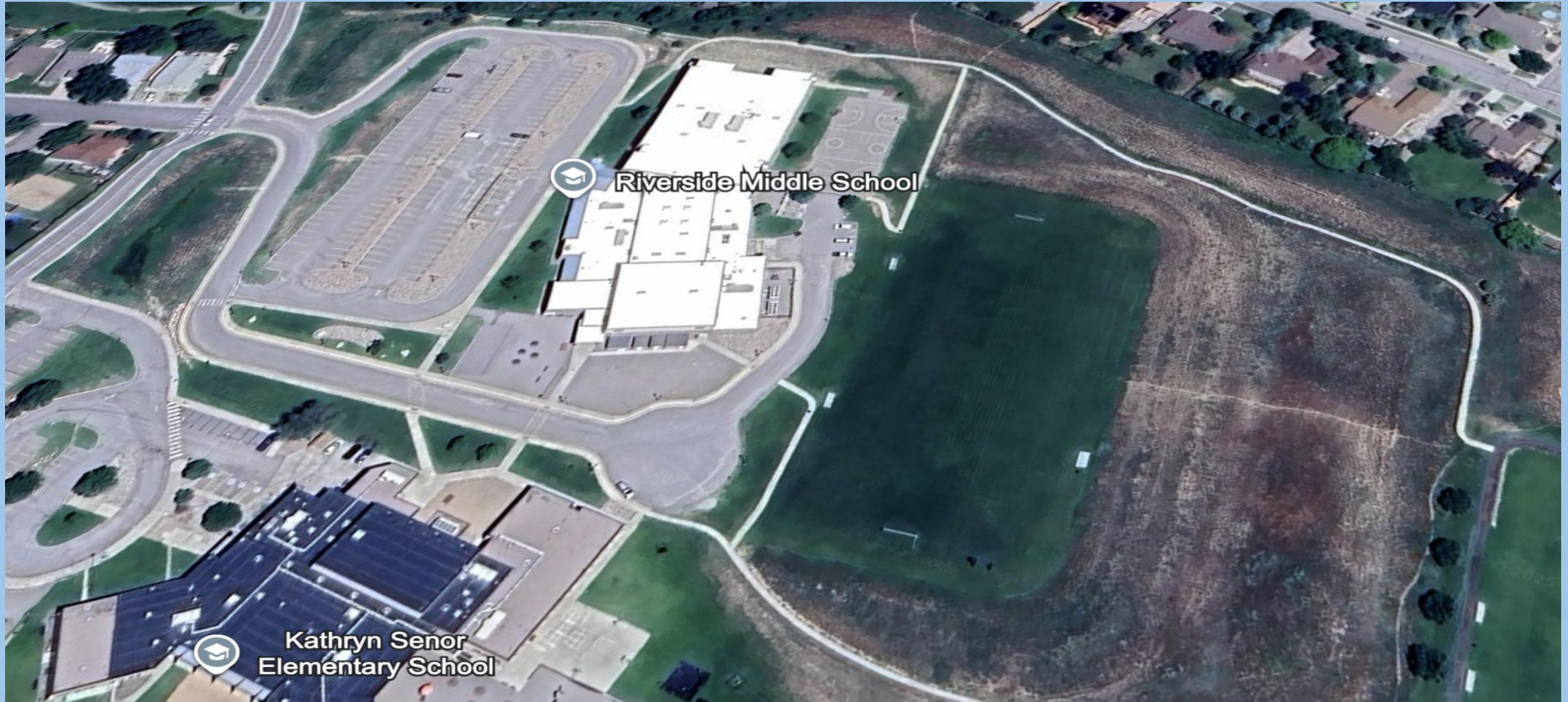
Riverside Middle School