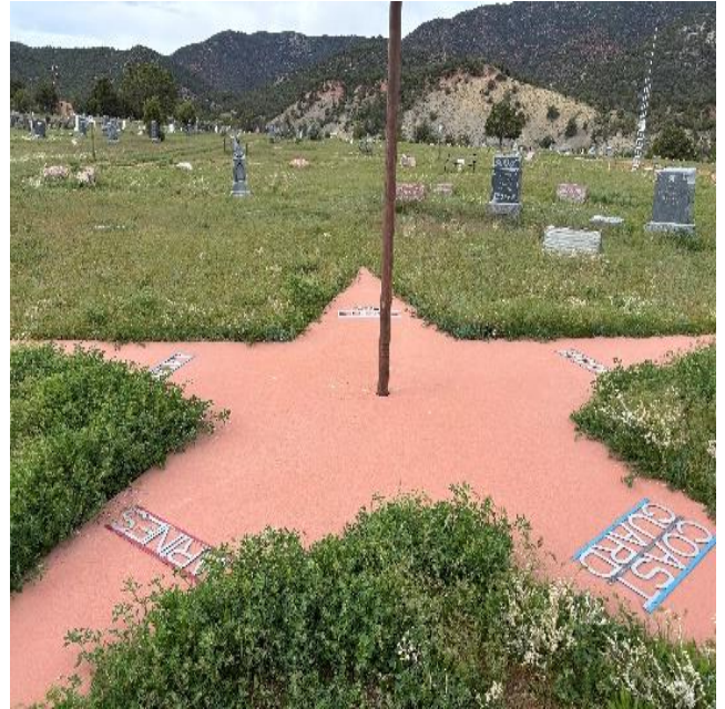
Old Soldier's Circle