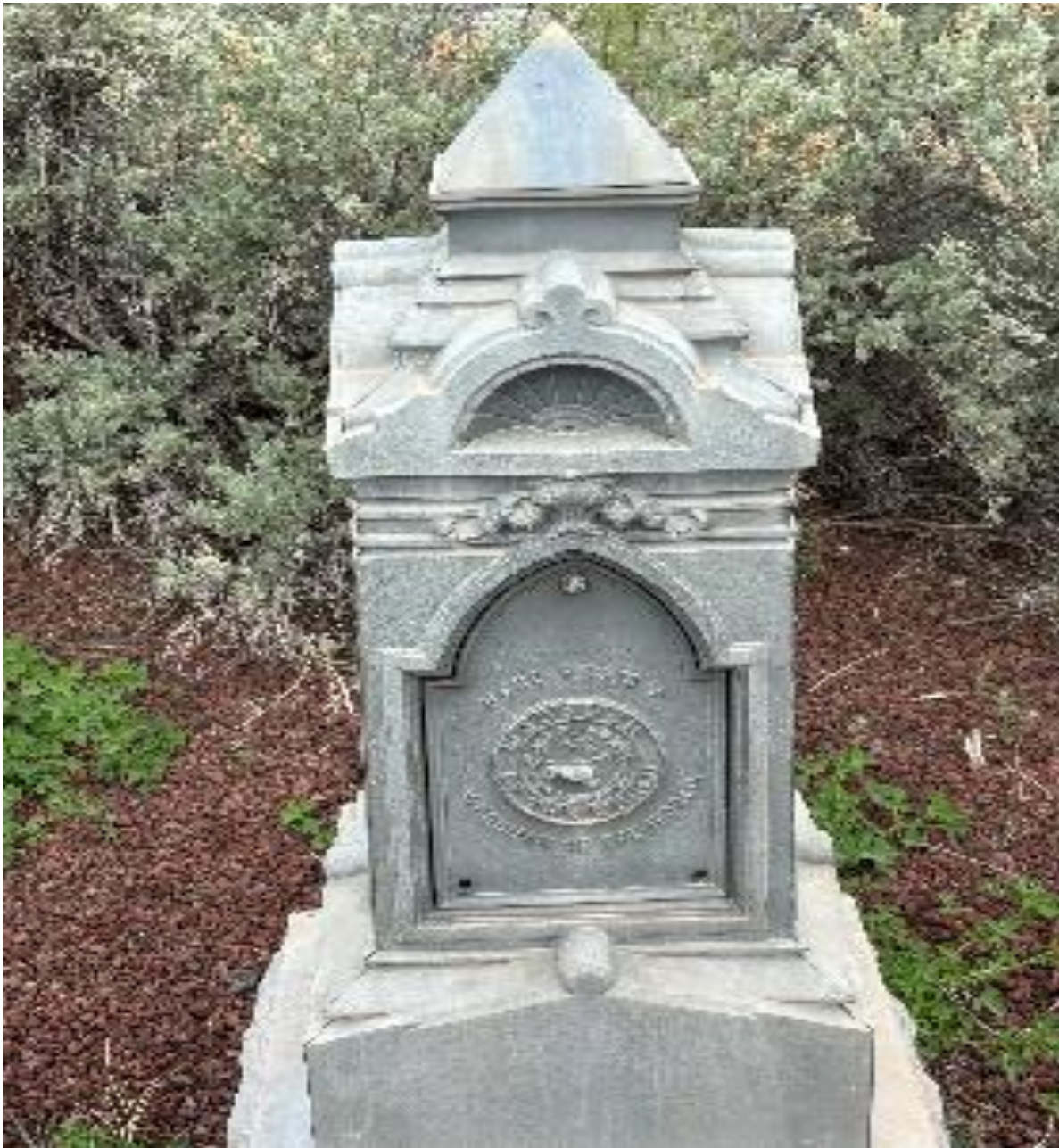
Woodsmen of the World Tombstone