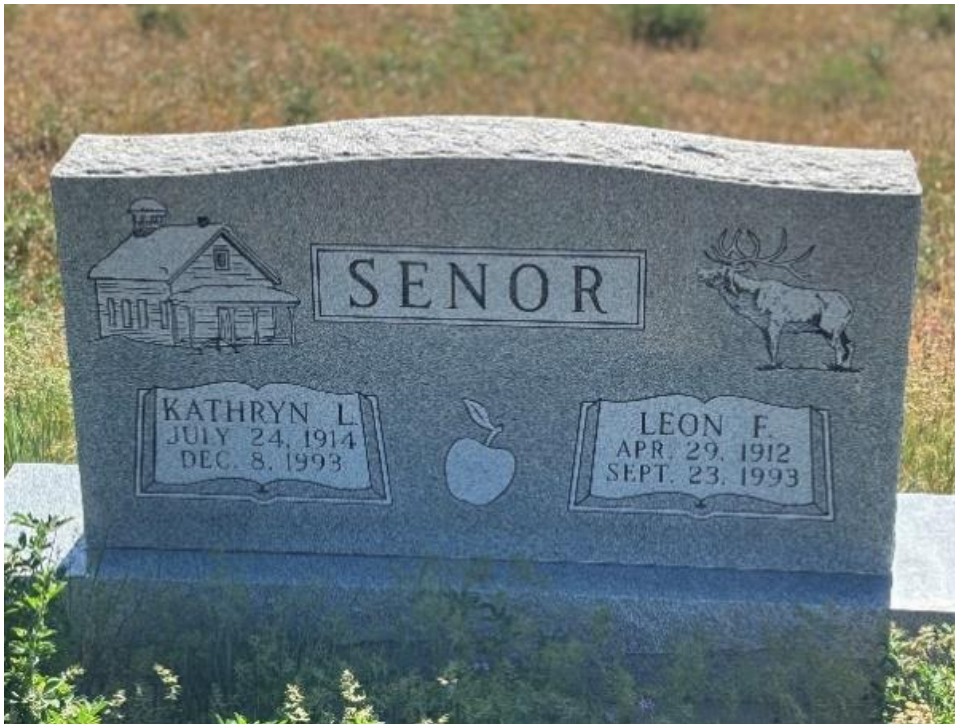
Teacher Whom KSE is Named After