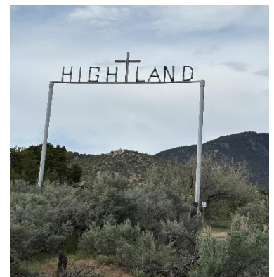
Original Cemetery Sign