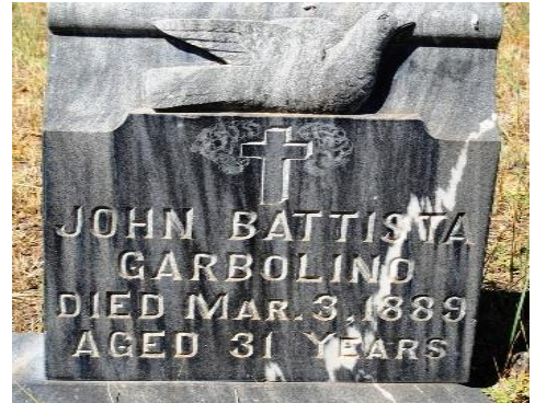
First Recorded Burial