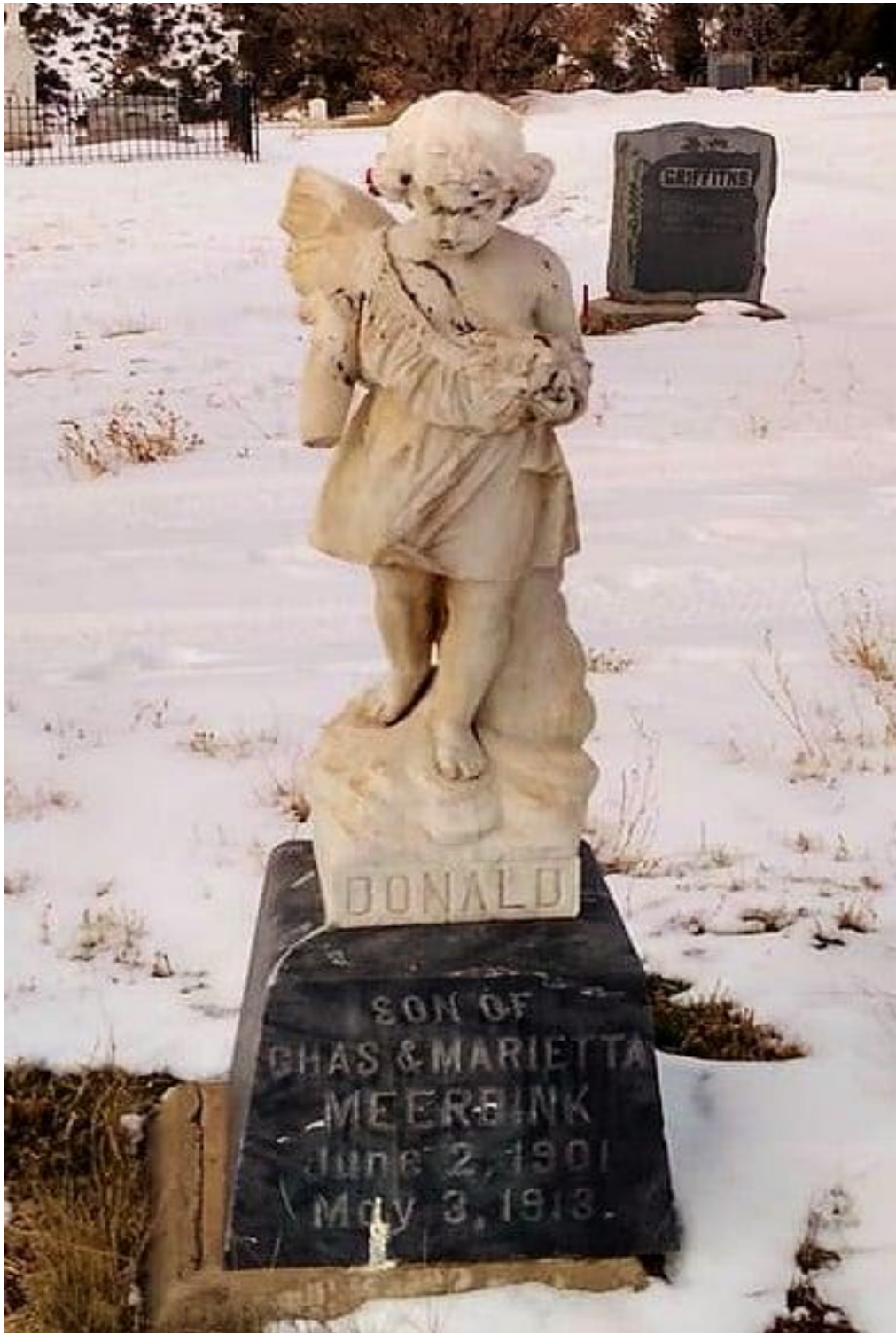
Child's Grave 1913