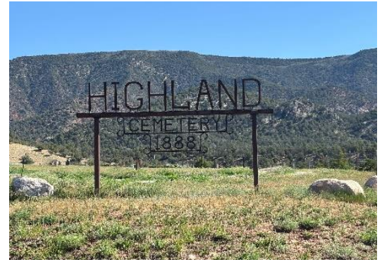
Newer Highland Cemetery Sign