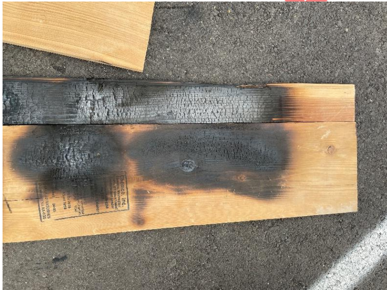
25 Class A/Class B Comparison

13 Subsection 503.2 #1.1 of the 2021 International Code Council's Wildland 14 Urban Interface Code as amended by Ordinance TC 2023-7 is hereby repealed.