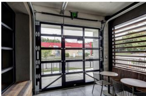
Currently Approved Replacement Door