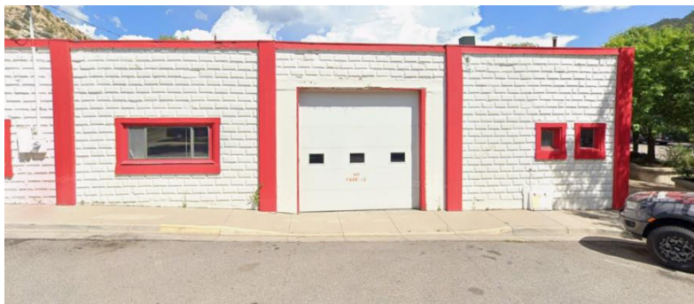
Original Garage Door