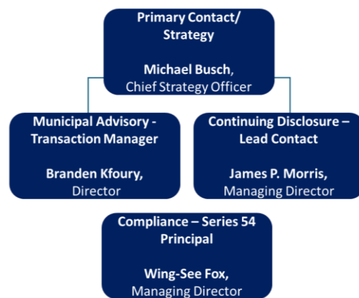
Project Team Organizational Chart

Provided below is a summary of the assigned team, qualifications, education, and relevant experience.