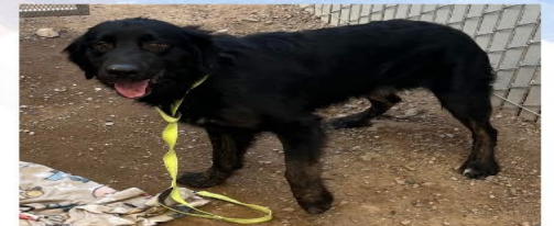
Erin - male aprox. 1-2 years old border collie mix unaltered