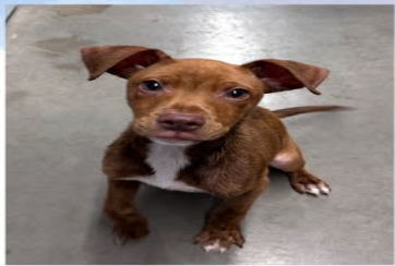
Coda - male - Lab mix - 3 months old - neutered