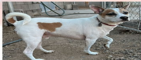
Odie - male Jack Russell mix 3 years old - neutered