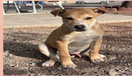
Heath - male - 5 months old Pit/Sharpei mix unaltered