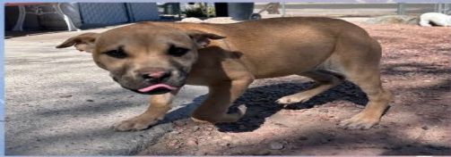
Cookie - female - 5 months old - Pit/Sharpei mix unaltered