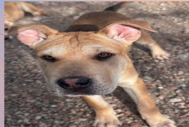
Honey - female - 5 months old - Pit/Sharpei mix unaltered