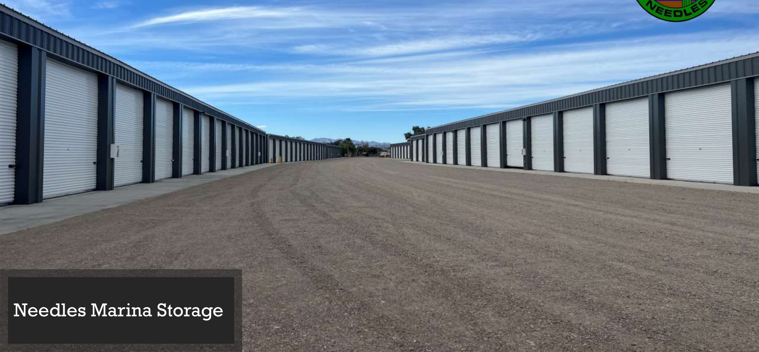
Needles Marina Storage