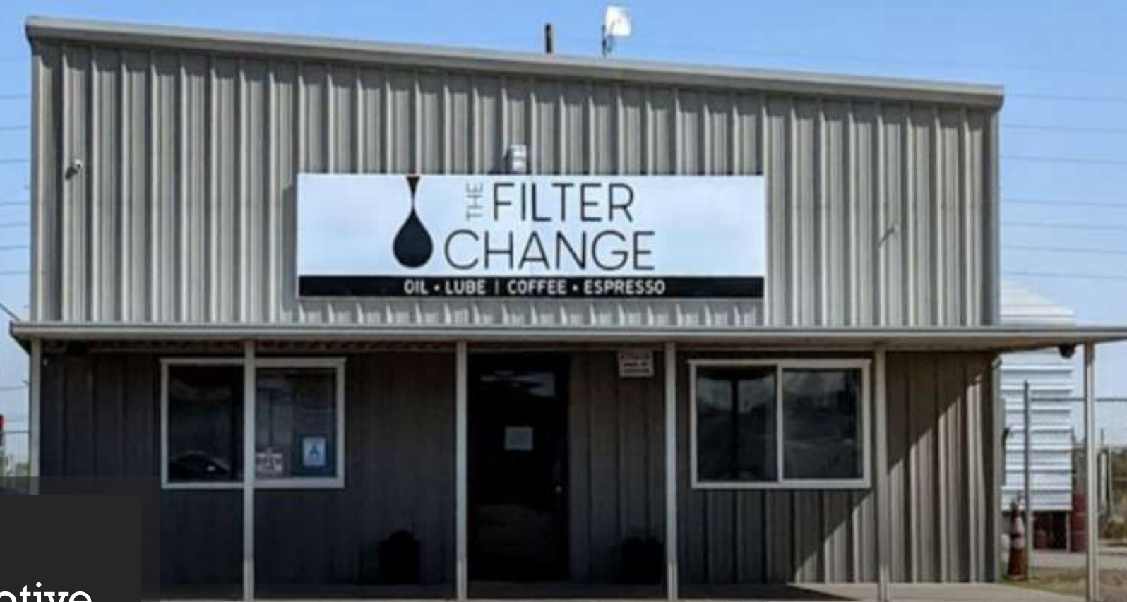
The Filter Change Coffee and Automotive