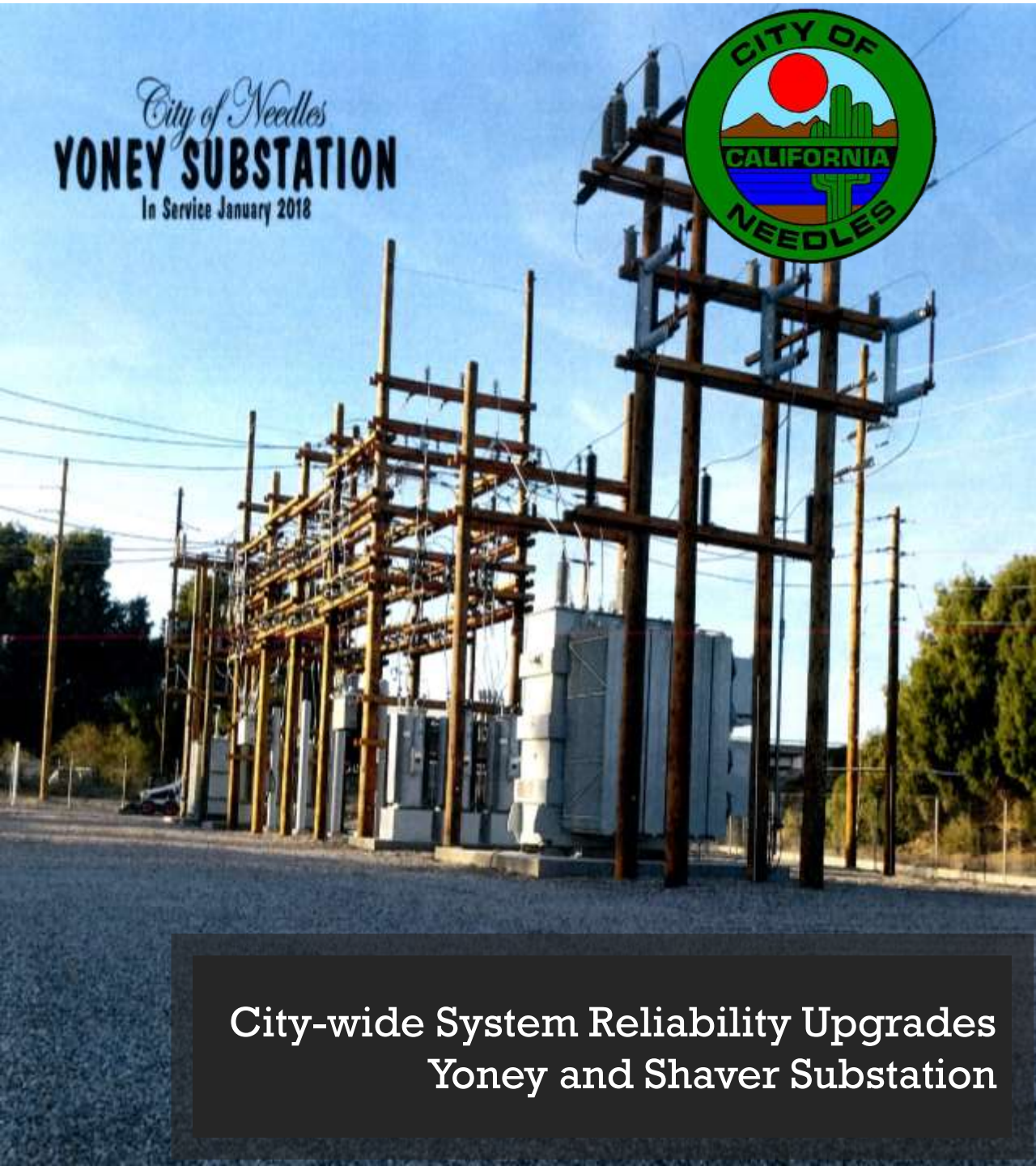
City of Needles YONEY SUBSTATION In Service January 2018