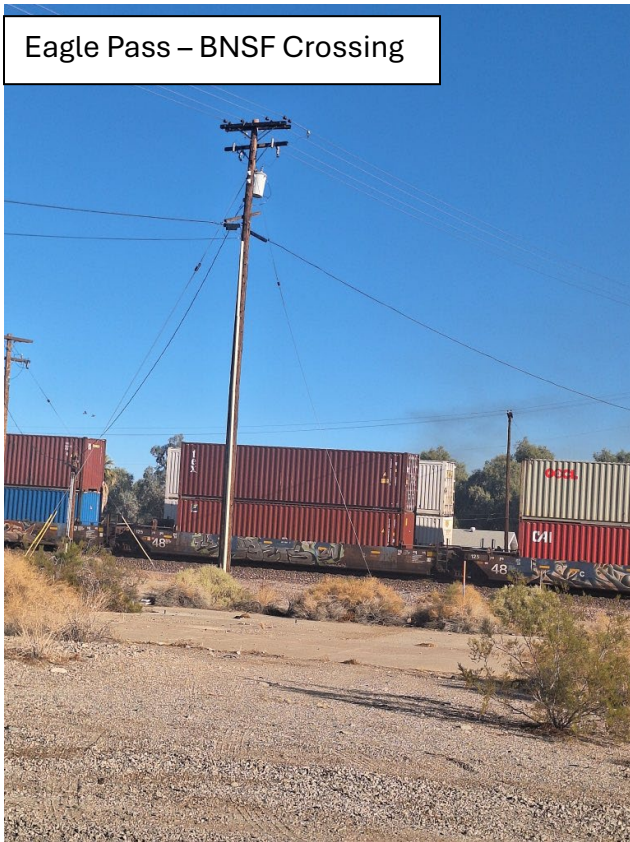
Eagle Pass – BNSF Crossing