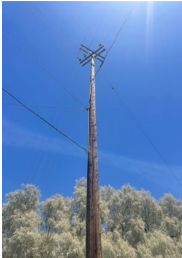
Needles Highway – Flood Control Crossing