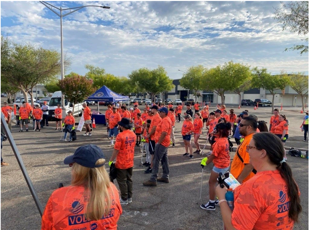
Clean California Designation Program criteria include a commitment from