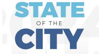
Exhibit Your Business at "The State of the City" Market Night!

We wanted to let you know about a fantastic opportunity to showcase your business at our upcoming "STATE OF THE CITY " event. This year, prior to the meeting, we are creating an open-air market setting on the lawn of El Garces. We're inviting our members, including you, to reserve a space, bring a table, and take the opportunity to engage with the community, network with fellow business owners, and promote your products or services.