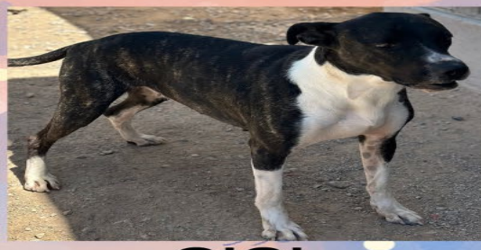
BOXER MIX APROX 2 YEARS OLD VACCINATED NOT SPAYED