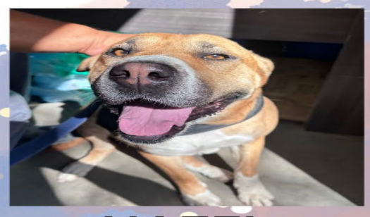
HAZEL SHARPEI/PITBULL MIX APROX 2 YEARS OLD SPAYED & VACCINATED