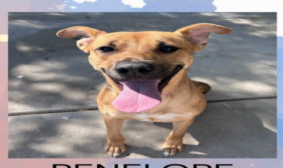
SHEPHERD/LAB MIX 9 MONTHS VACCINATED NOT SPAYED