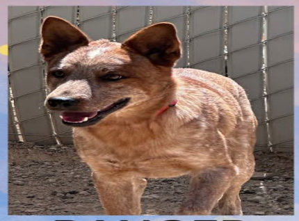
RANGER HEELER APROX 2 YEAR OLD VACCINATED NOT FIXED