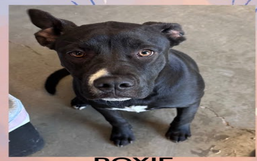
PITBULL/LAB MIX APROX 8 MONTHS OLD VACCINATED NOT SPAYED