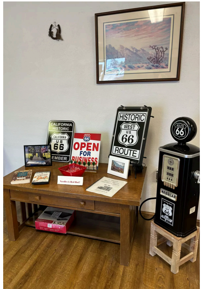
The heat is ingrained in Needles’ culture. City officials offer Red Hots candy at public meetings, with a sign reading “Needles is Red Hot.”