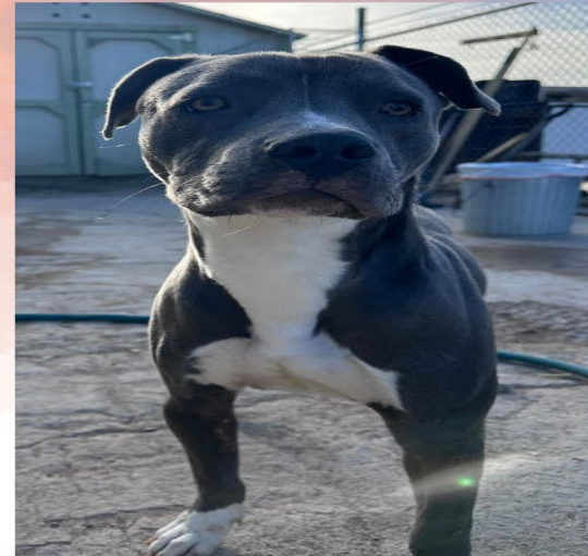
MIKEY Male - Pitbull