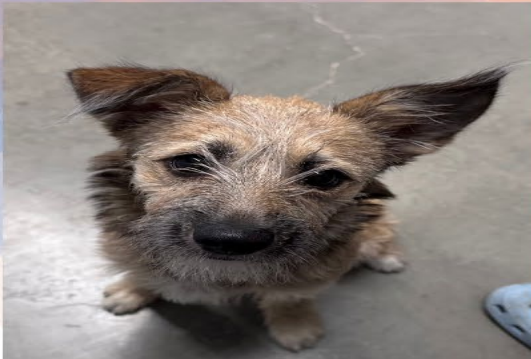
MOLLIE Female - Terrier Mix