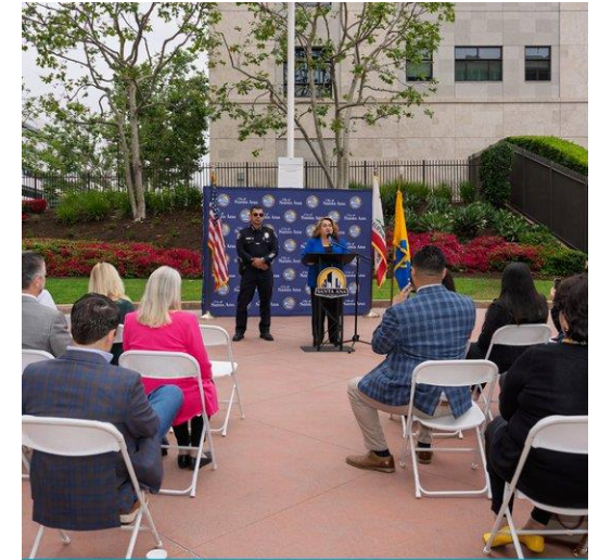
State oversight of recovery housing is 'broken,' say lawmakers and city leaders

This measure would require the Department of Health Care Services (DHCS) to meet specific timelines for investigating allegations of unlicensed treatment services, allow counties to work with the department to conduct site visits and enforce licensure laws themselves, and require follow-up site visits to ensure unlawful activity has stopped.