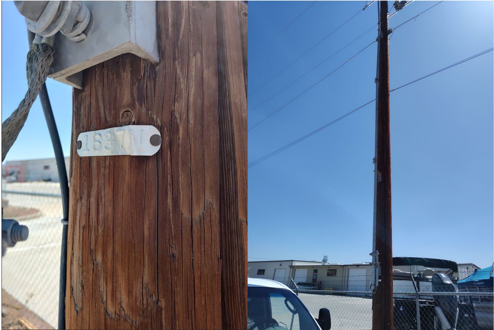
POLE #7: 1637N