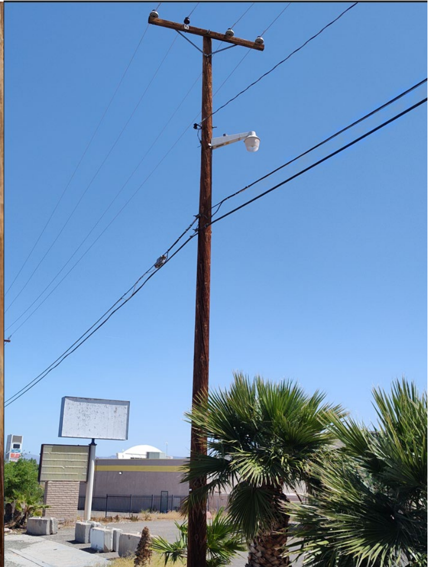
POLE #4: 4742N