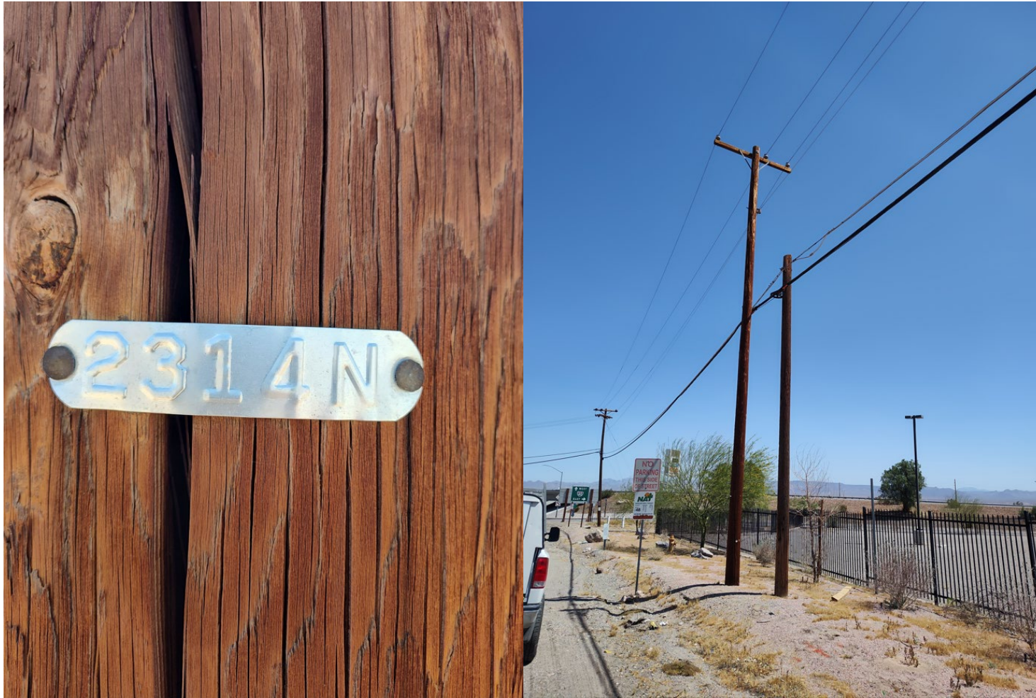
POLE #1: 2314N