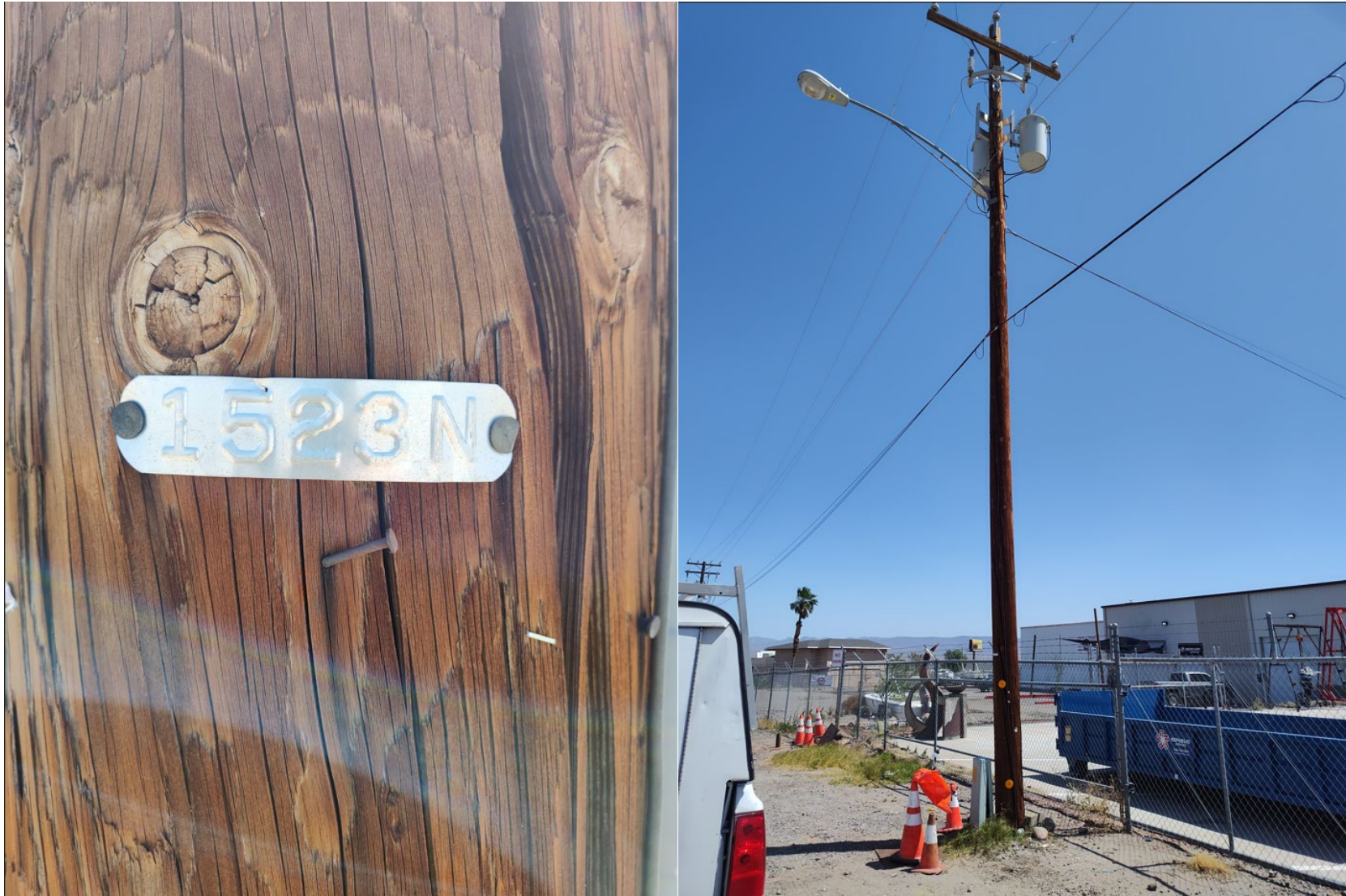
POLE #6: 1523N