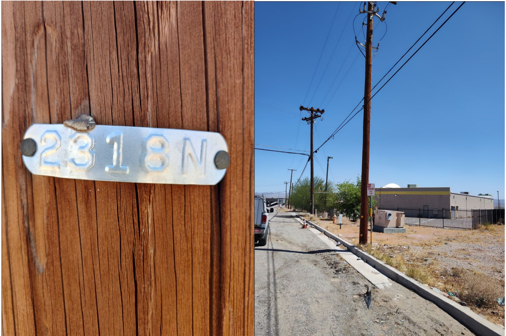
POLE #3: 2318N