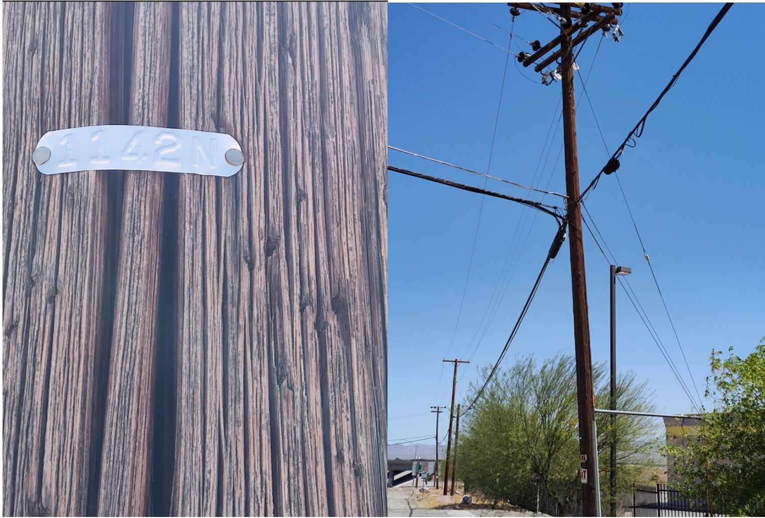
POLE #2: 1142N