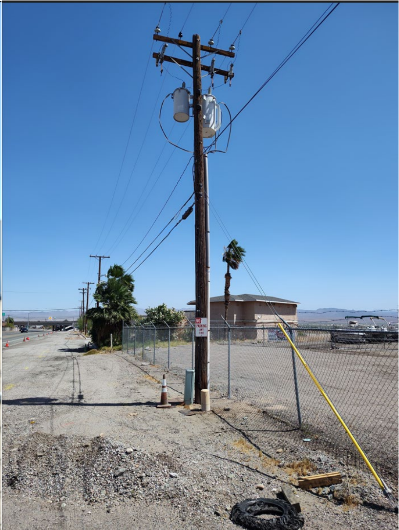
POLE #5: 1146N