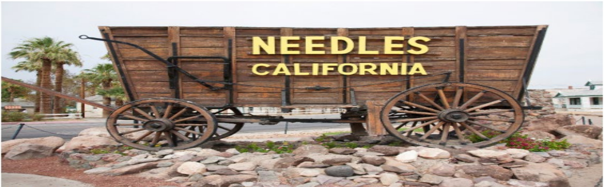
Wooden wagon on Route 66 welcomes drivers to Needles.

Needles is one of the oldest cities in San Bernardino County, located in the eastern portion of the county near the borders of Arizona and Nevada.