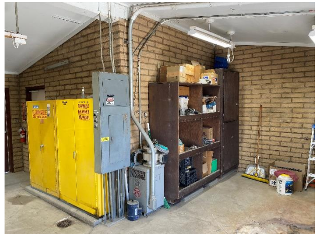
FORMER STORAGE AREA, PRE-CONSTRUCTION