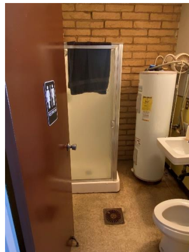
PREVIOUS SHOWER AND RESTROOM, PRE-CONSTRUCTION