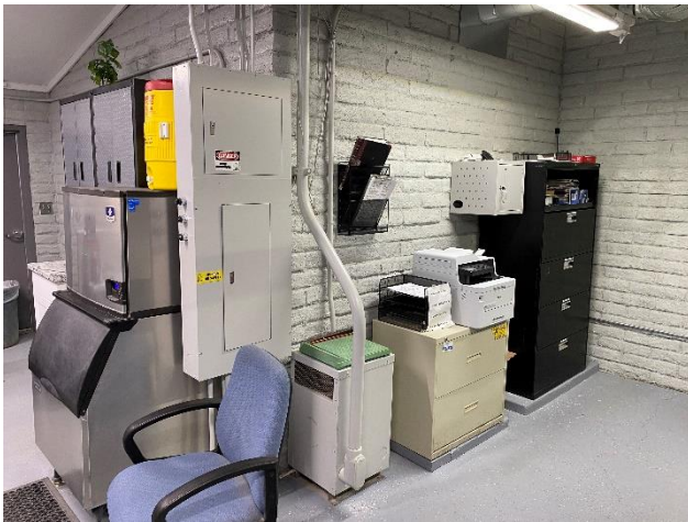
NEW OFFICE AREA, POST -CONSTRUCTION