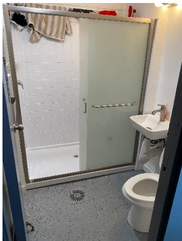
NEW SHOWER AND RESTROOM, PRE-CONSTRUCTION