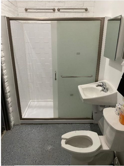
NEW SHOWER AND RESTROOM, POST CONSTRUCTION