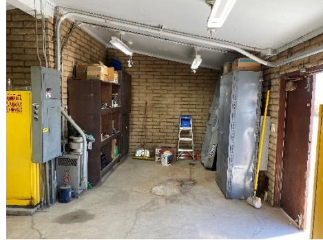
FORMER STORAGE AREA PRE-CONSTRUCTION