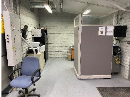
NEW OFFICE AREA POST CONSTRUCTION