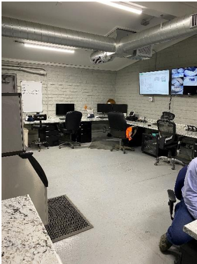
NEW OFFICE AREA, POST CONSTRUCTION