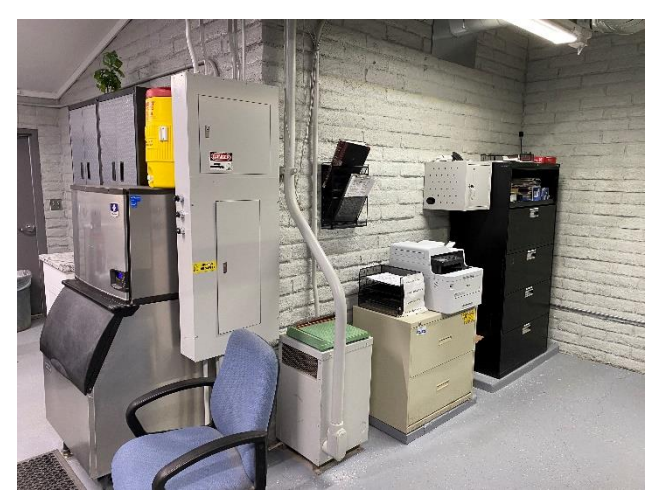
NEW OFFICE AREA, POST -CONSTRUCTION