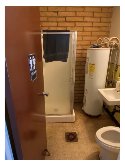
PREVIOUS SHOWER AND RESTROOM, PRE-CONSTRUCTION