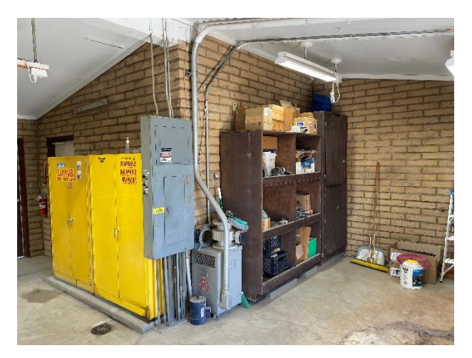
FORMER STORAGE AREA, PRE-CONSTRUCTION