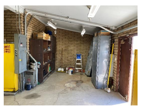
FORMER STORAGE AREA PRE-CONSTRUCTION