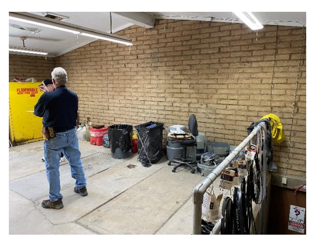
FORMER STORAGE AREA, PRE-CONSTRUCTION