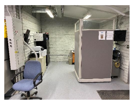
NEW OFFICE AREA POST CONSTRUCTION

PRE-CONSTRUCTION AND POST-CONSTRUCTION PHOTOS