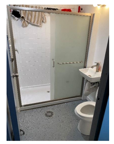
NEW SHOWER AND RESTROOM, PRE-CONSTRUCTION