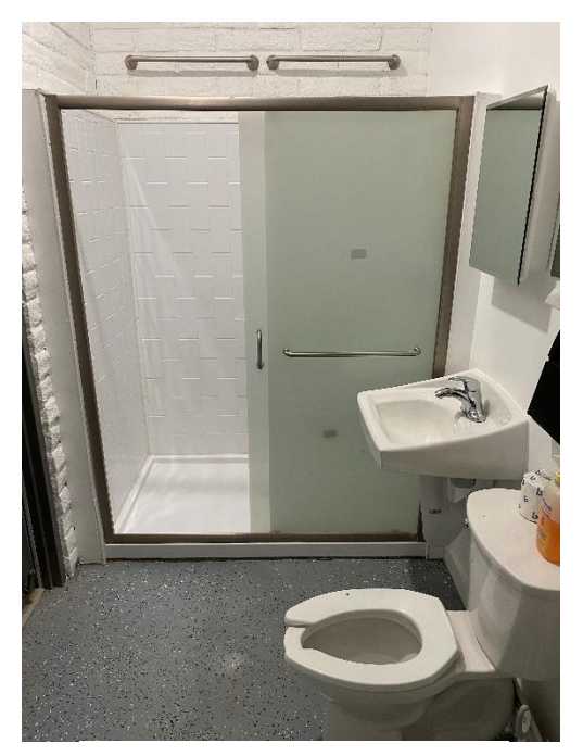
NEW SHOWER AND RESTROOM, POST CONSTRUCTION