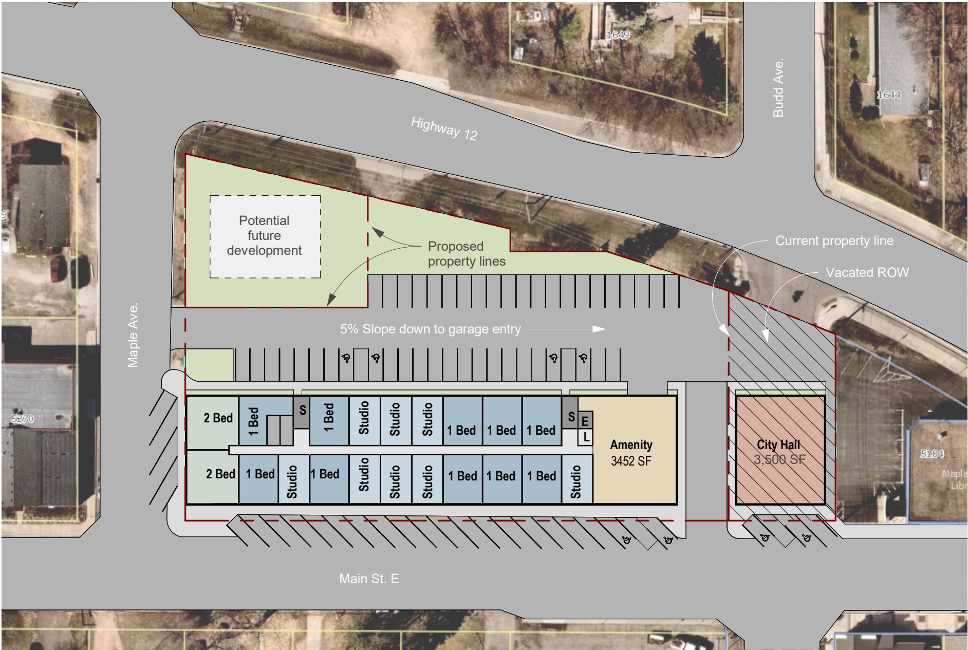
Site Context / 1st Floor Plan