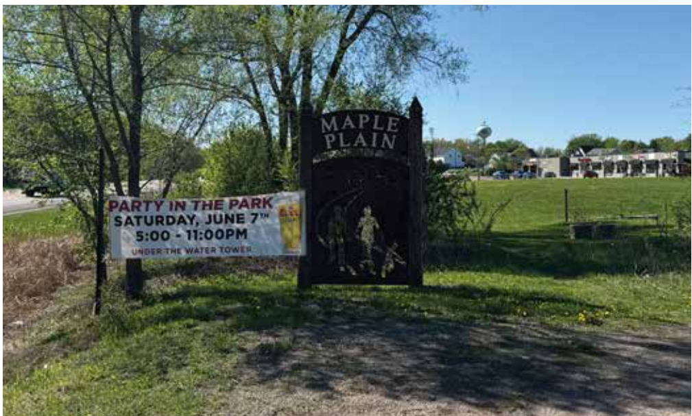
BEFORE - NOT TO SCALE