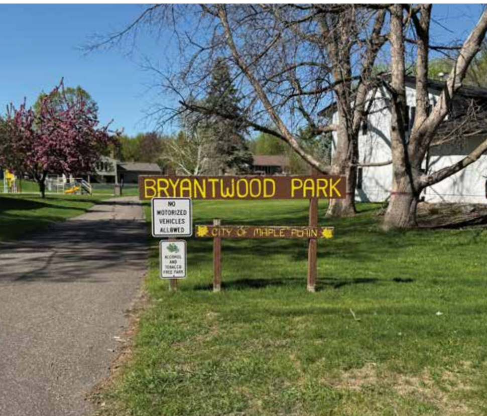
BEFORE - NOT TO SCALE