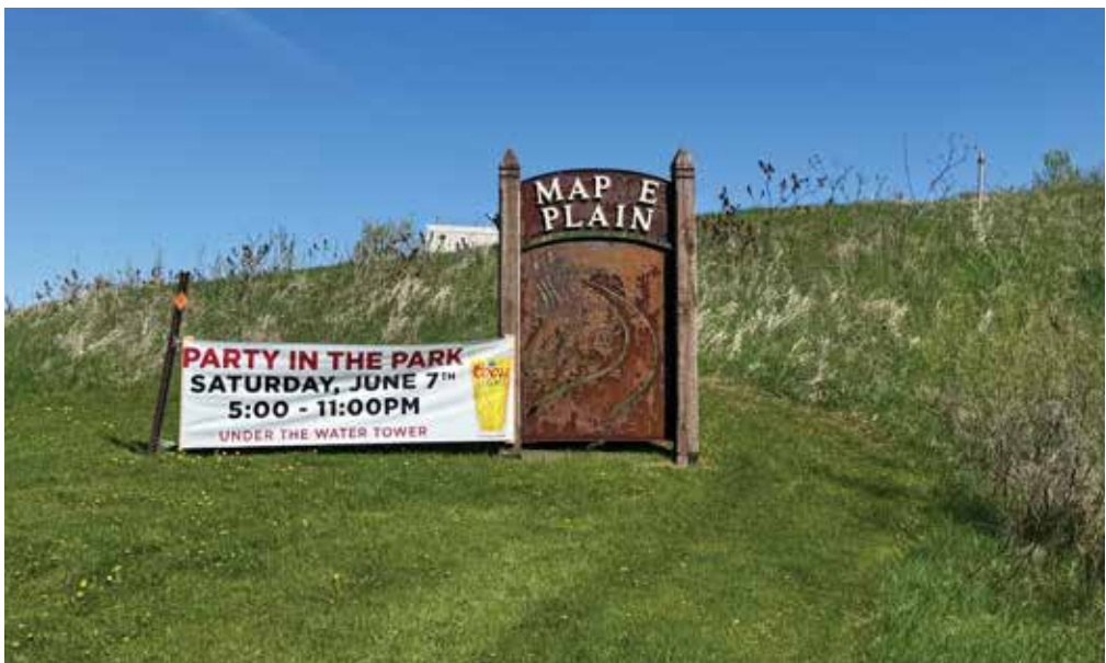
BEFORE - NOT TO SCALE