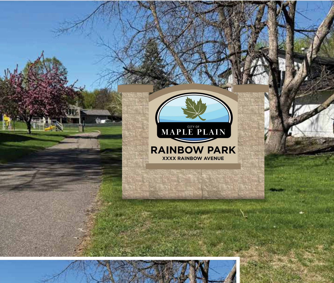
AFTER - NOT TO SCALE

The client warrants that the subject matter to be printed is not copyrighted by a third party. The client also recognizes that because subject matter does not have to bear a copyright notice in order to be protected by copyright law, absence of such notice does not necessarily assure a right to reproduce. The client further warrants that no copyright notice has been removed from any material used in preparing the subject matter for reproduction. To support these warranties, the client agrees to indemnify and hold Scenic Sign harmless for all liability, damages and attorney fees that may be incurred in any legal action connected with copyright infringement involving the work production of provided.