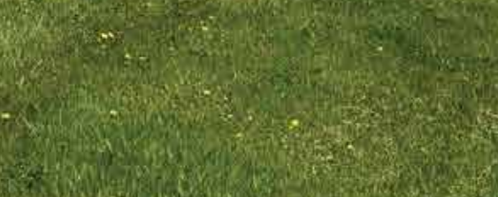
AFTER - NOT TO SCALE - DAY VIEW