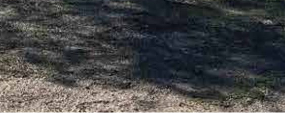
AFTER - NOT TO SCALE - DAY VIEW