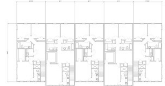
SECOND FLOOR PLAN SCALE: 1/8" = 1'-0" @ 24"X36" OR 1/16" = 1'-0" @ 12"X18"