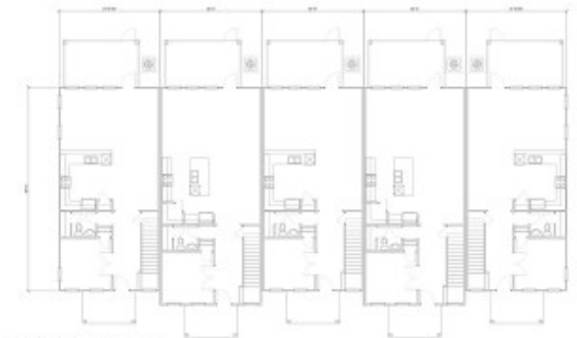
FIRST FLOOR PLAN SCALE: 1/8" = 1'-0" @ 24"X36" OR 1/16" = 1'-0" @ 12"X18"

Proposed Homes: the same architecture as the units under construction on the north side of Hwy 52