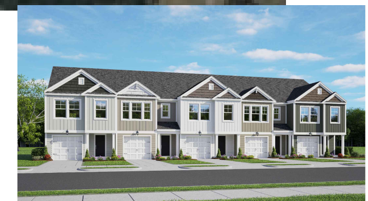
TYPE 1 SECTION - 5 UNIT TOWNHOME (NOT TO SCALE)