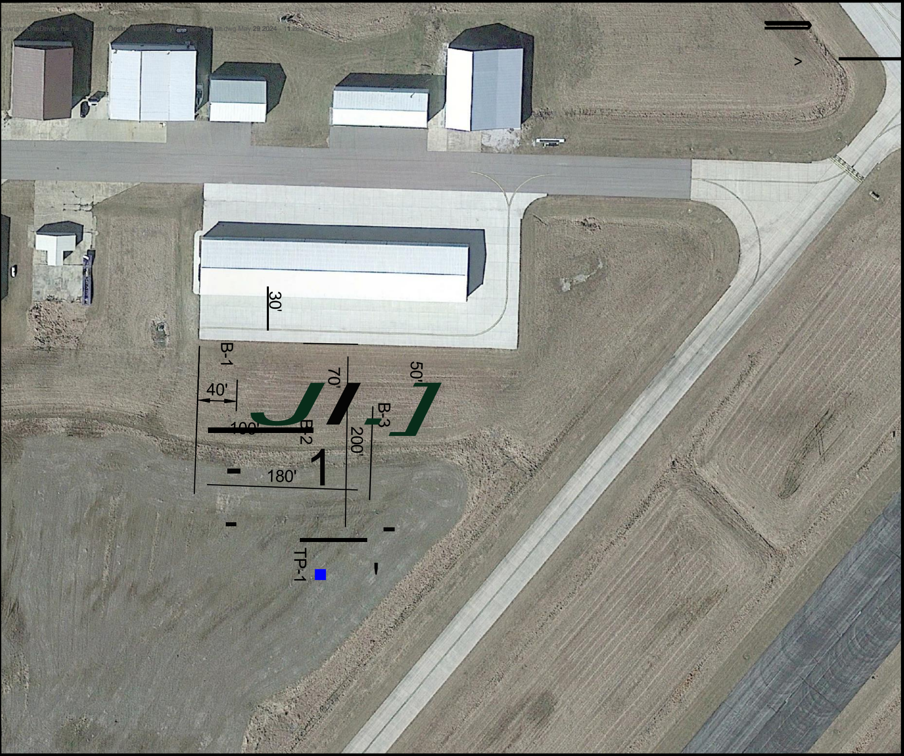
EXHIBIT B: GEOTECH LIMITS