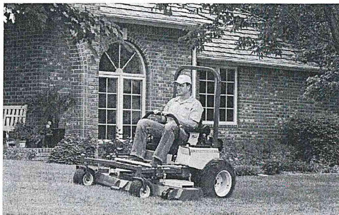
Featured Model 225 with 52-inch DuraMax ® deck

48-in. - 25 lbs. (11.3 kg); 52-in. - 29 lbs. (13.2 kg); 61-in. - 36 lbs. (16.3 kg).