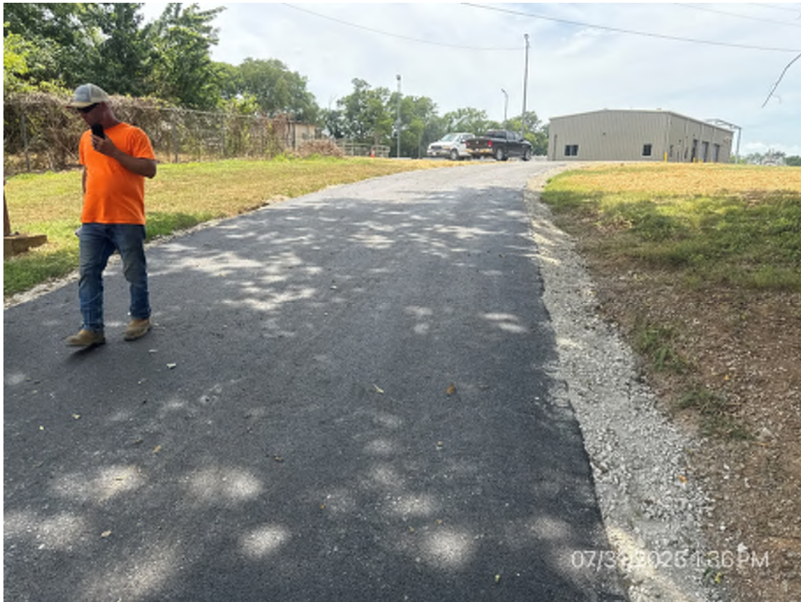
2. Paved Driveway