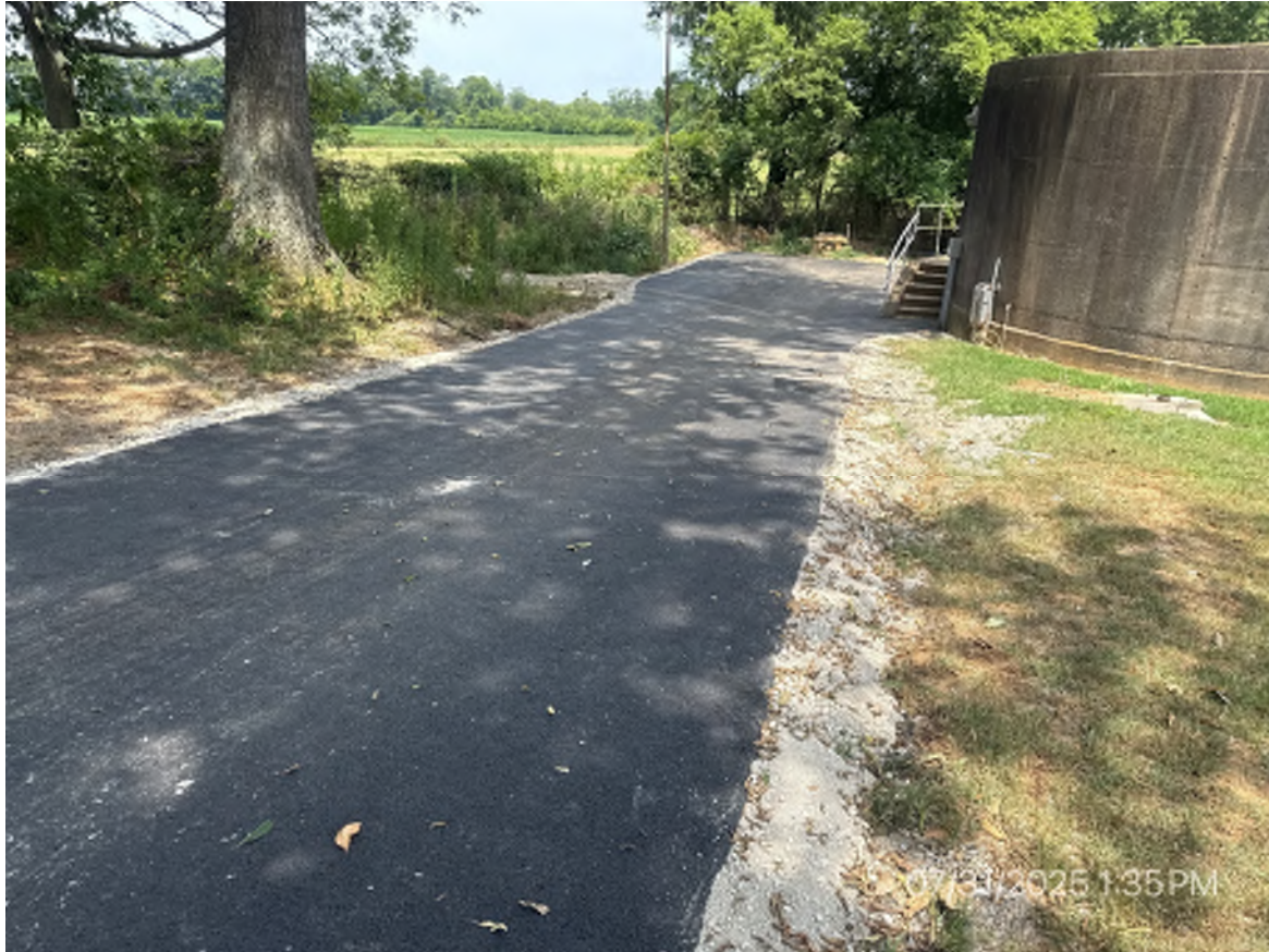
1. Paved Driveway