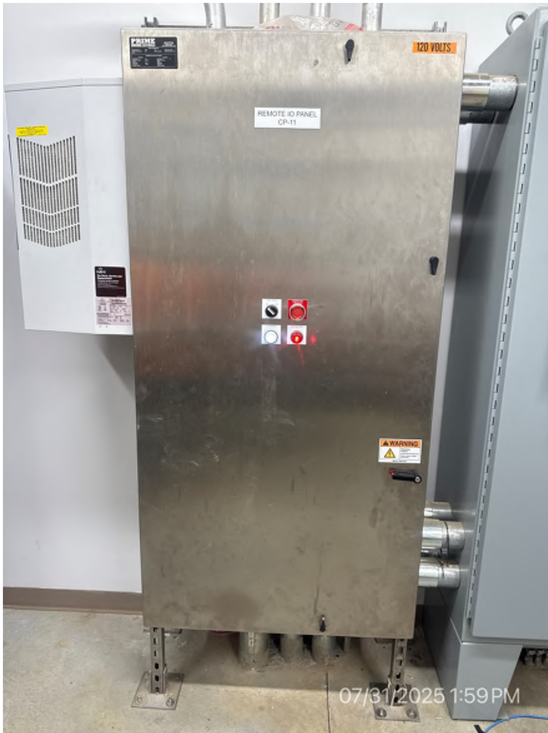
4. RP Panel Label Added