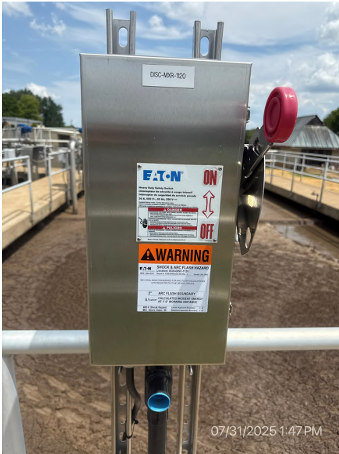
3. Disconnects Labeled